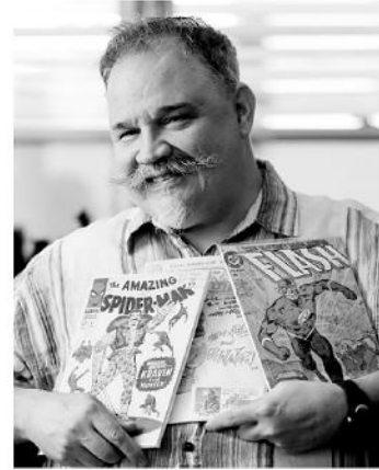
Daily Sun Staff

seen William Shatner and a lot of big names. A fun, whimsical part of it was seeing people in their costumes. It was just a fun