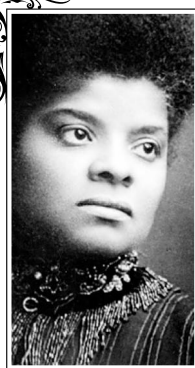
IDA B. WELLS