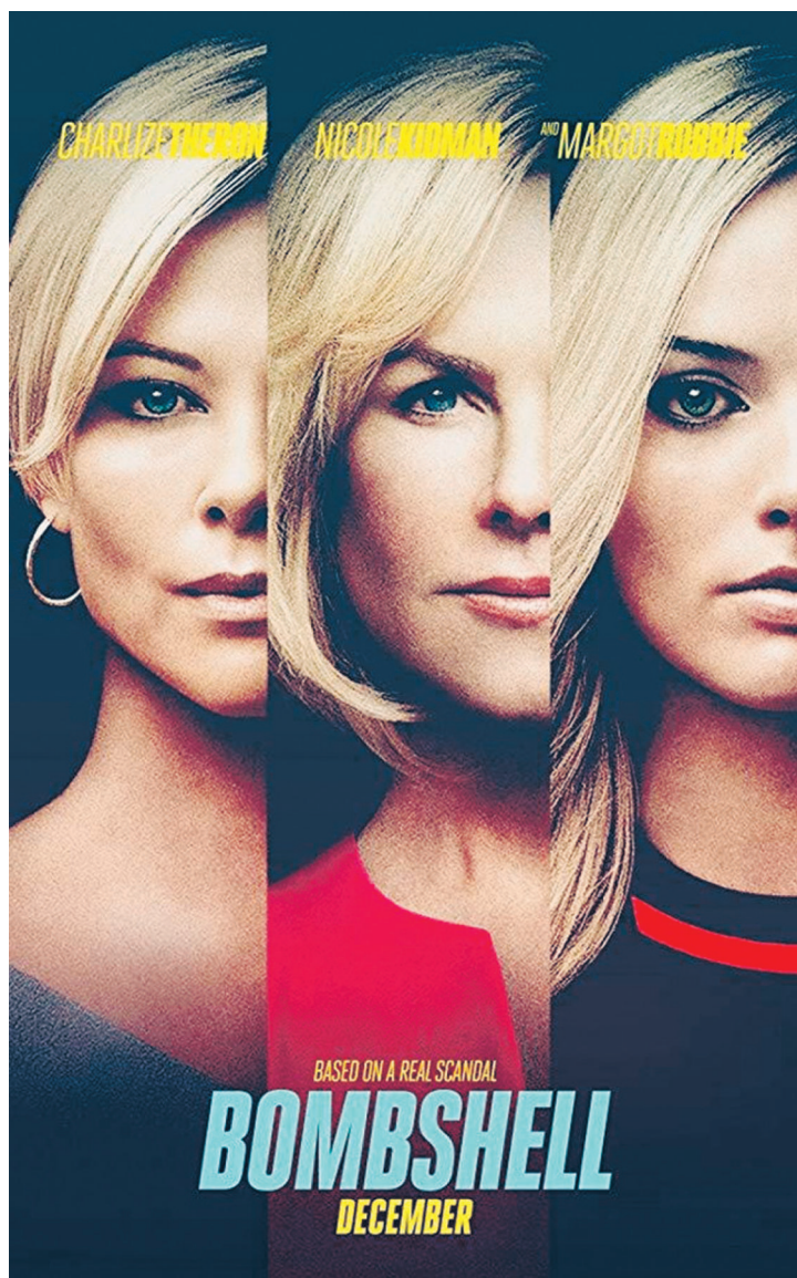
"Bombshell," starring Charlize Theron, Nicole Kidman and Margot Robbie, was released Dec. 13.