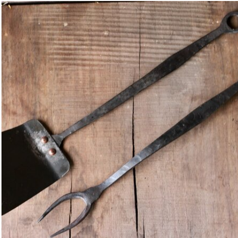
Grilling Duo - Spatula and BBQ Fork