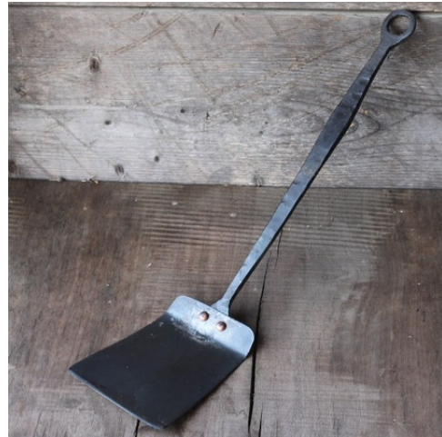
Grilling Spatula - Circle Handle