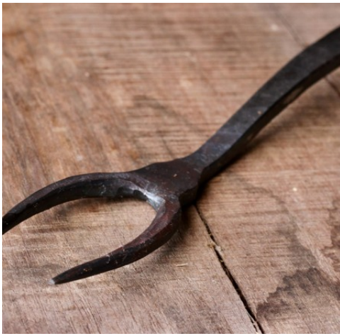
BBQ Fork - Circle Handle