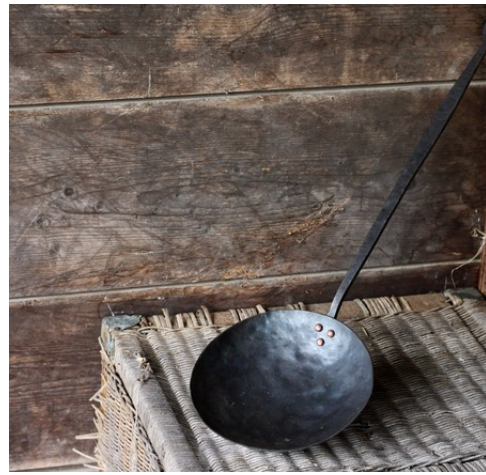
Camping Cooking Pan