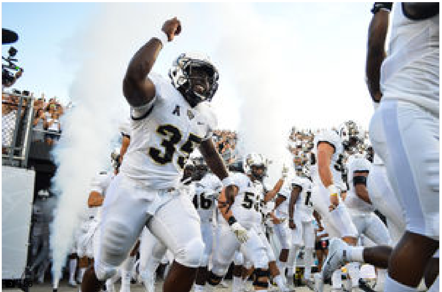
Photos: UCF Knights shut out South Carolina State in First Frost Updated Sep 15, 2016