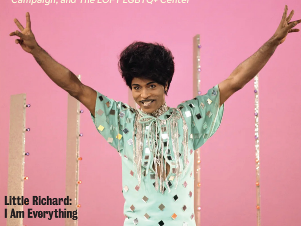
Little Richard: I Am Everything

Presented in partnership with WFUV, Human Rights Campaign, and The LOFT LGBTQ+ Center