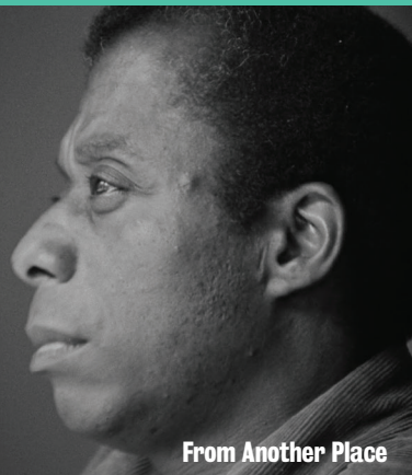
From Another Place

Part of REMIX: The Black Experience in Film, Media, and Art, which is sponsored by National Endowment for the Arts