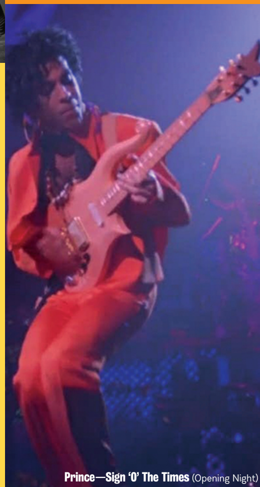
Prince—Sign 'O' The Times (Opening Night)

Info-line: 914.747.5555 • burnsfilmmuseum.org