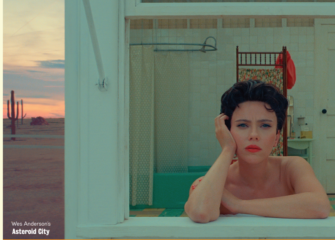
Wes Anderson's Asteroid City

A Community-Supported Theater with Five Screens