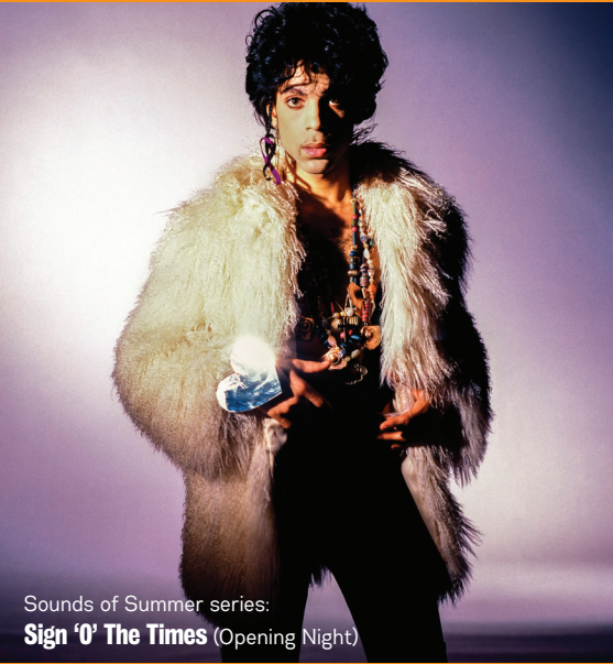
Sounds of Summer series: Sign 'O' The Times (Opening Night)