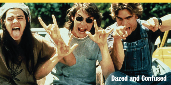
Dazed and Confused

Sponsored by The Lucille and Paul Maslin Foundation • WFUV is the exclusive media partner