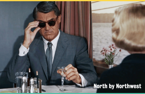
North by Northwest