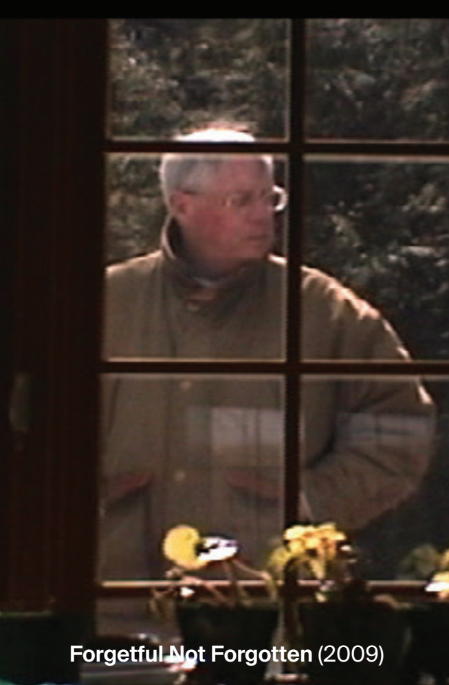
Forgetful Not Forgotten (2009)