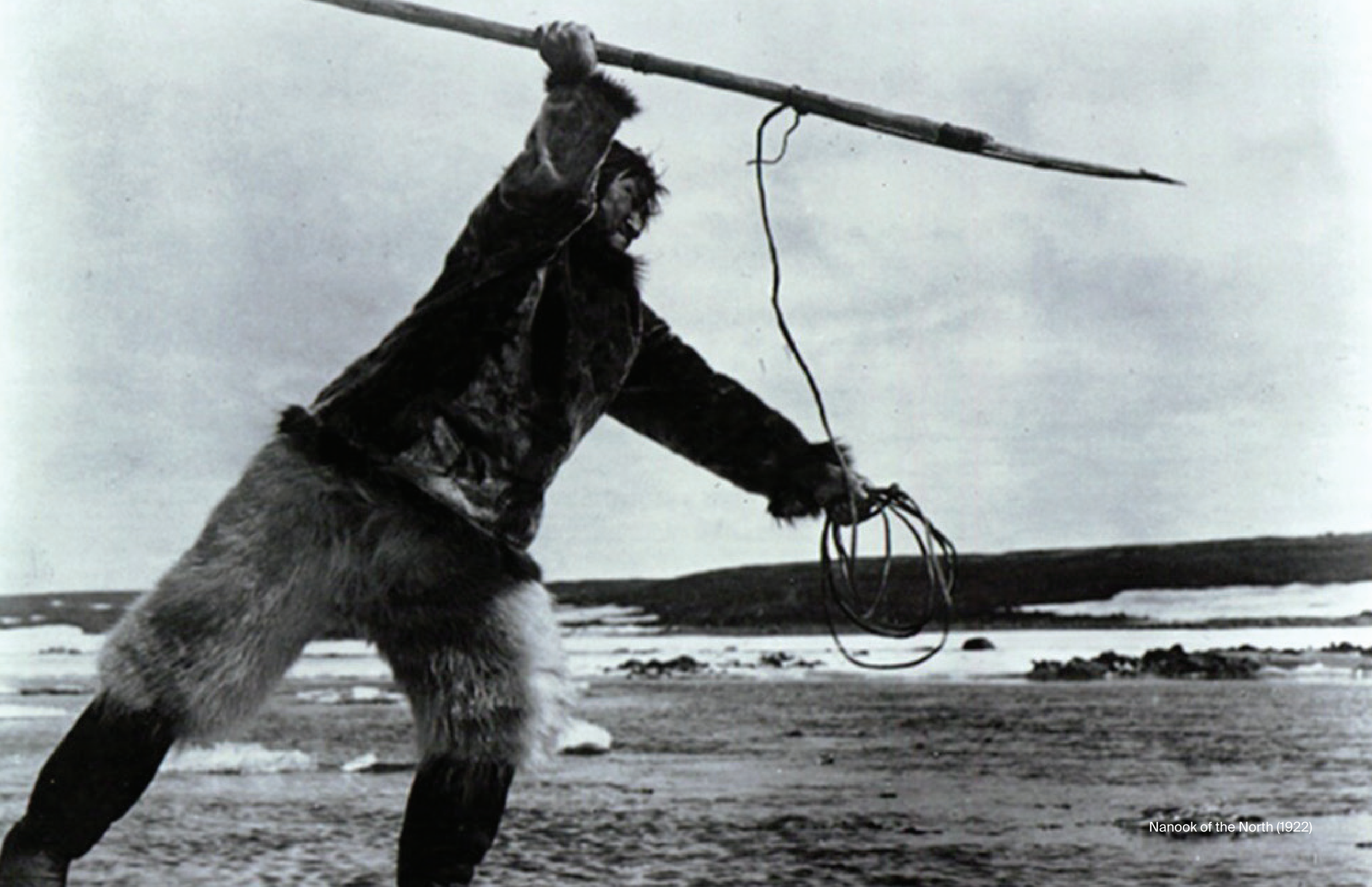
Nanook of the North (1922)