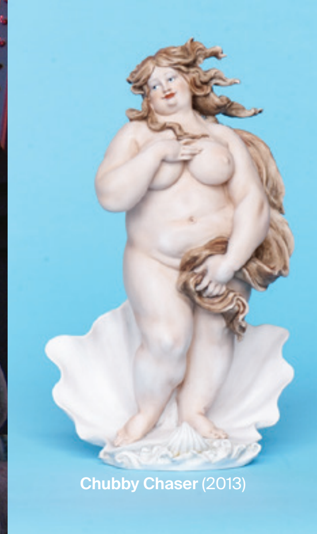
Chubby Chaser (2013)