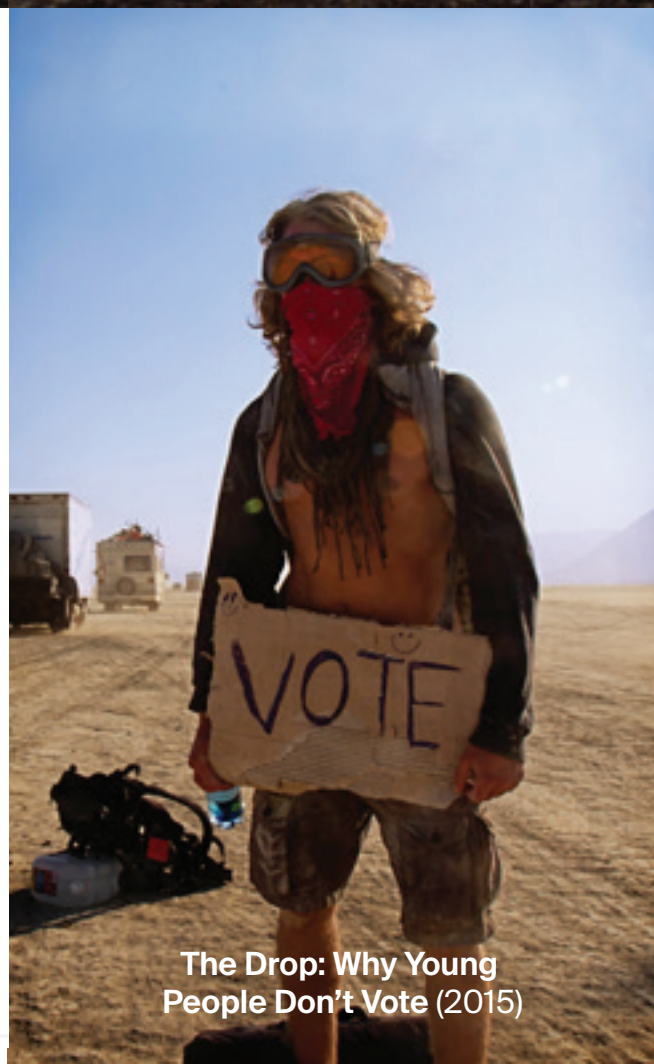
The Drop: Why Young People Don't Vote (2015)