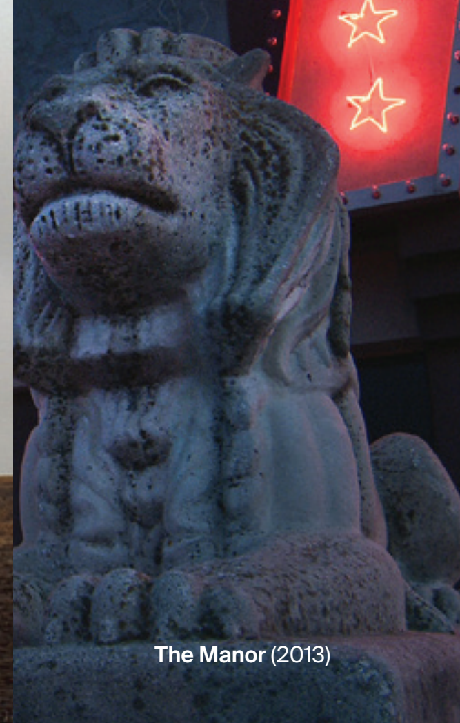
The Manor (2013)