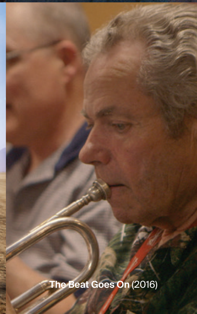
The Beat Goes On (2016)