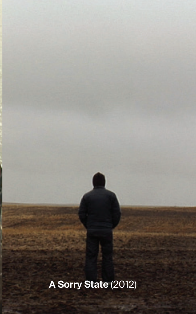
A Sorry State (2012)