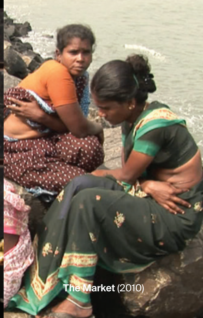
The Market (2010)