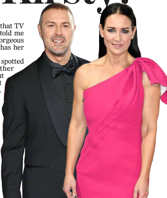
'COSY': Paddy McGuinness and Kirsty Gallacher