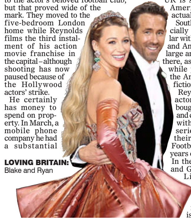
LOVING BRITAIN: Blake and Ryan

In the process Reynolds and Gossip Girl star Ms Lively, 35, have immersed themselves in the UK, and last month visited the Great British Bake Off tent.