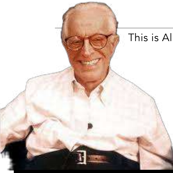
This is Albert Ellis. I love this guy.

In essence, Ellis believed that valuing self-esteem and striving to be "good" in the eyes of others is irrational and self-defeating. He encouraged unconditional self-acceptance and focusing on personal growth and well-being, rather than seeking validation through self-esteem.