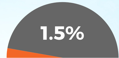
to Black populations