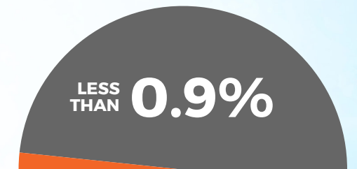
to Indigenous populations