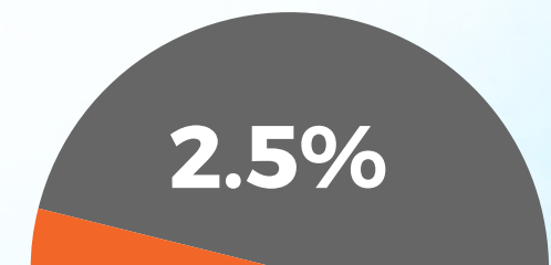
to populations living with disabilities