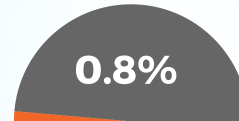
to Latinx populations