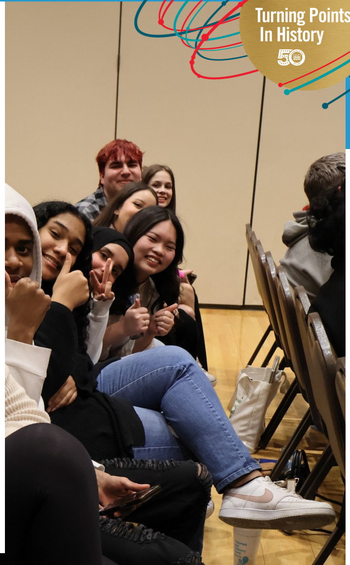
Above: students wait for the Awards Ceremony to start