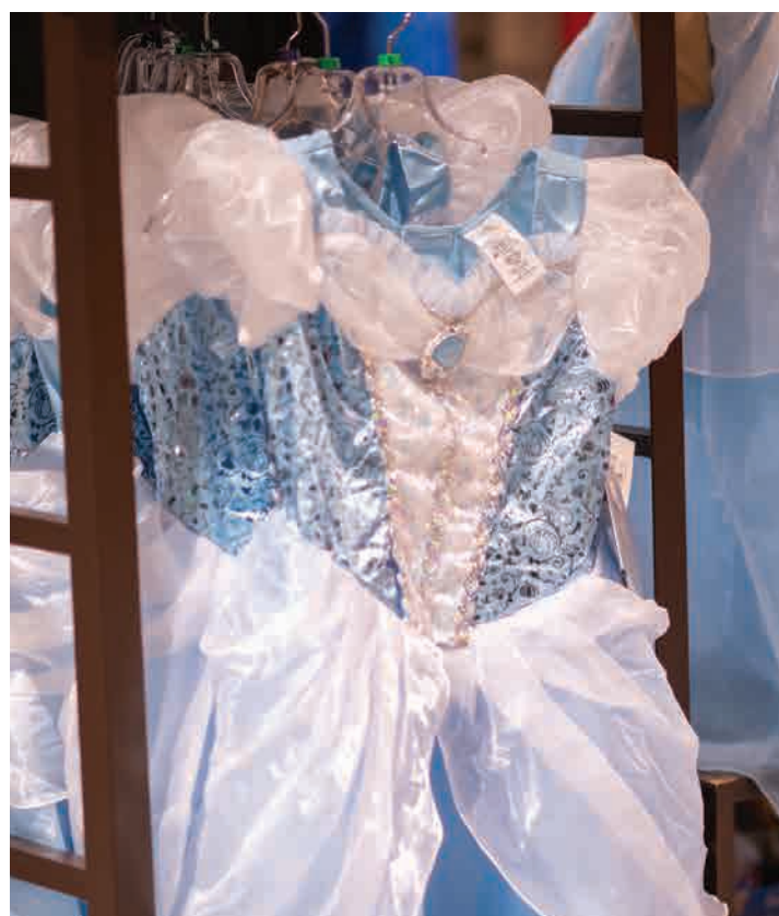
Don't have a princess dress handy? Sir Mickey's has a wide variety, including this Cinderella dress.

Another way you can help your princess prepare for their royal debut is by giving them proper princess lessons before your visit. Teach them how to give a royal princess wave and a proper curtsy,