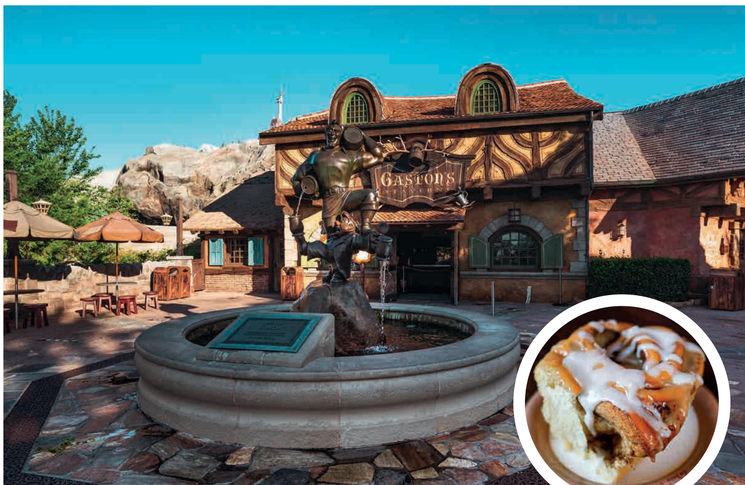
Chow down on a cinnamon roll fit for royalty at Gaston's Tavern.