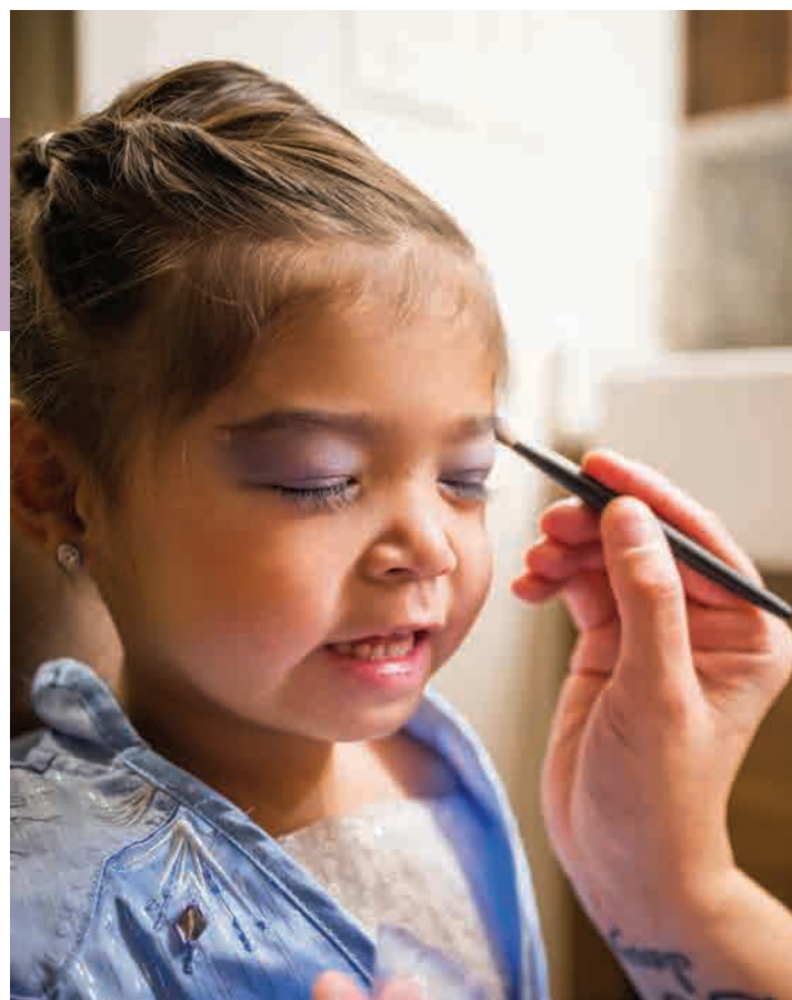
DIY the makeover to save some bucks—and make your princess feel royal before you walk inside the gate! OPPOSITE: Anyone can be a princess for a day at Walt Disney World.