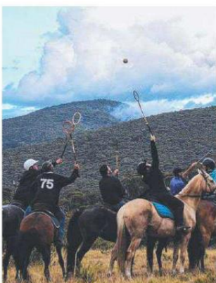
Users impacted by the proposed closure.

The rally will start at 11am on Sunday on a section of Long Plain Rd on the Port Phillip Fire Trail.