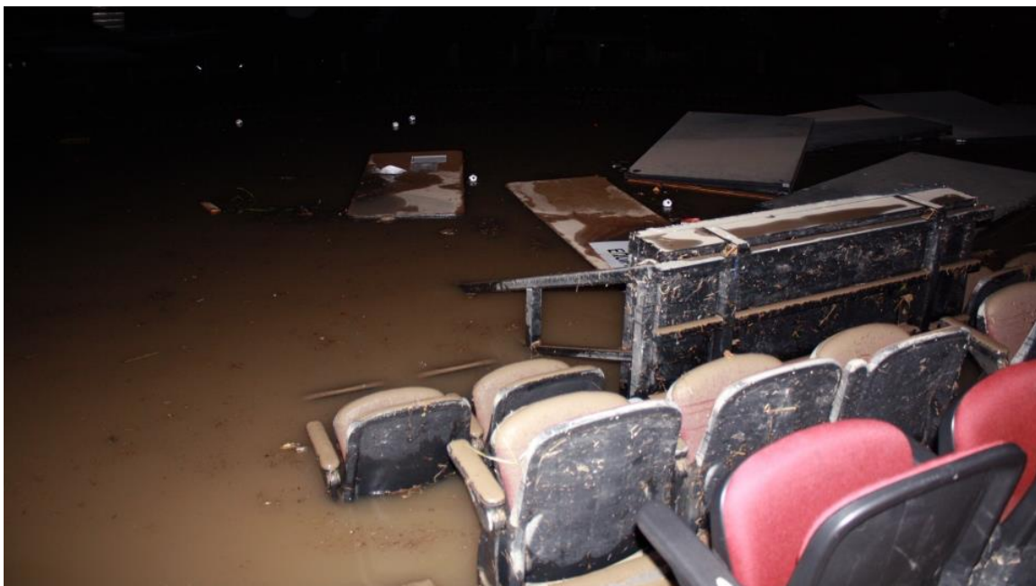
[Photograph of swamped Saddledome].

In June 2013, the Bow and Elbow Rivers flooded many parts of Calgary, including the Saddledome. The arena flooded up to the eighth row and the event level of the facility was destroyed. The locker rooms and control rooms were swamped.