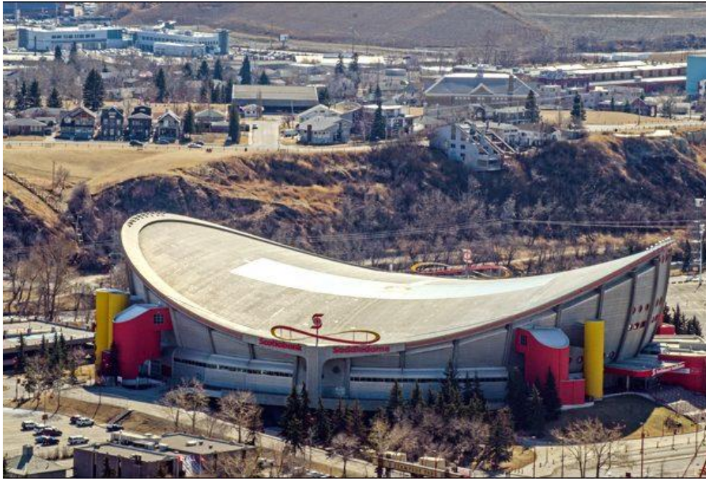
[Photograph of Scotiabank Saddledome]. (n.d.). Sports Team History. Retrieved October 10, 2020 from https://sportsteamhistory.com/calgary-flames

As construction is set to begin on the new arena for 2024, we look back at the old barn's most iconic moments.