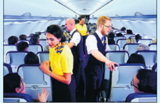
ALL ABOARD: Be nice for a Monarch upgrade

BLAGGERS can forget trying to bag an upgrade on Monarch flights using old tricks like honeymoons and birthdays. The airline is to offer complimentary perks to customers for simply being nice. In a year-long campaign to promote chivalry, courtesy and respect, 10 passengers per week will be rewarded with extra leg-room and priority check-in for polite behaviour. See monarch.co.uk BRAND-new Nature Rockz activities will be taking place at Haven