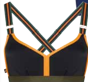
L'URV Army Jet Fire Sports Bra, £52; fashercise.com