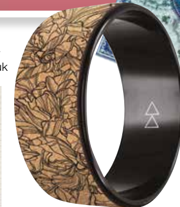
Yoga Design Lab The Yoga Wheel, £54; yogalabdesign.com