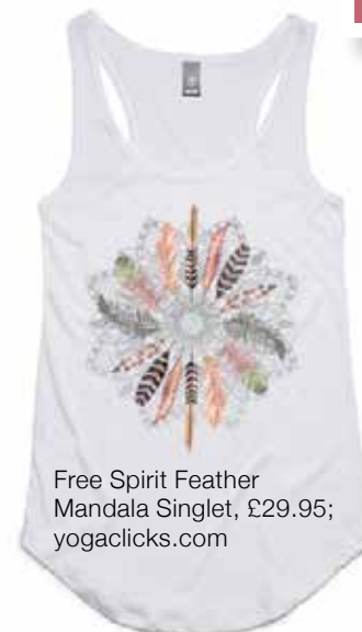
Free Spirit Feather Mandala Singlet, £29.95; yogaclicks.com