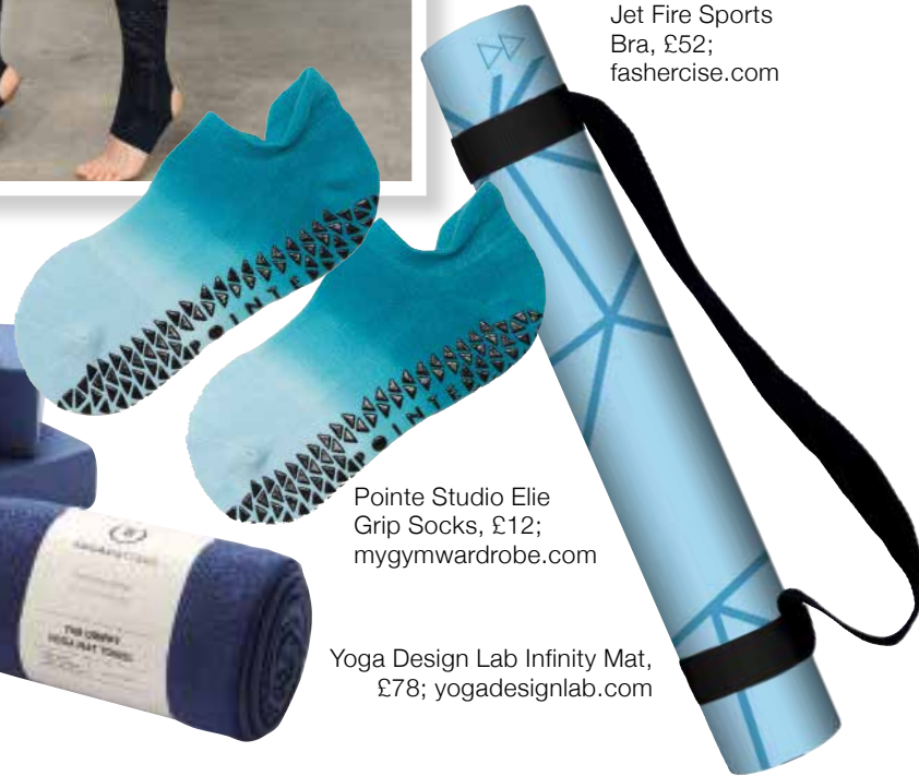
Pointe Studio Elie Grip Socks, £12; mygymwardrobe.com