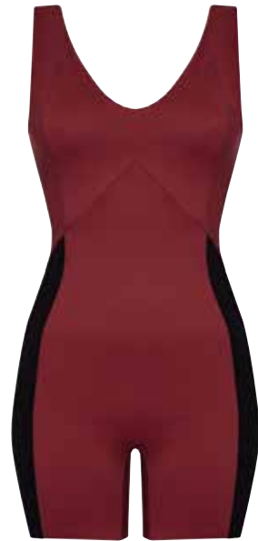
Silou Miranda Body, £199; siloulondon.com

here are the perfect pieces for your practice