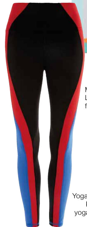
Michi NY Rally Leggings, £145; fashercise.com