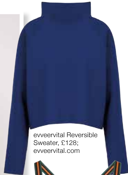
evveervital Reversible Sweater, £128; evveervital.com