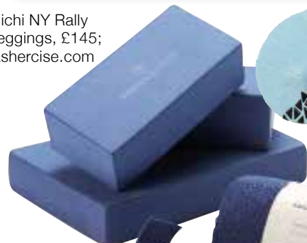
Yogamatters Yoga Prop Kit, £40; yogamatters.com