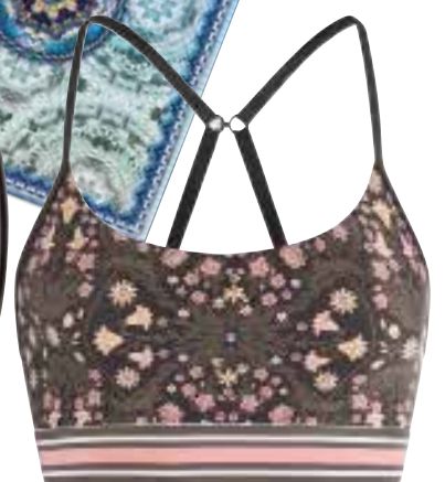
Lorna Jane Gypset Sports Bra, £54; lornajane.co.uk