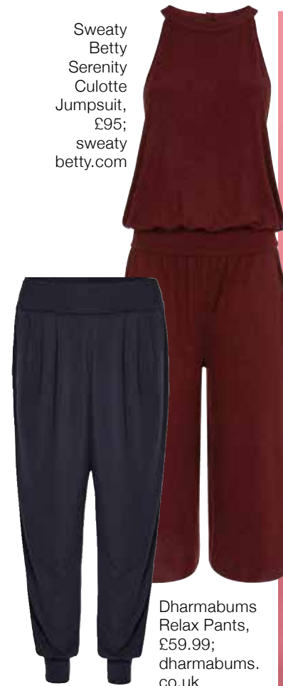
Sweaty Betty Serenity Culotte Jumpsuit, £95; sweatybetty.com