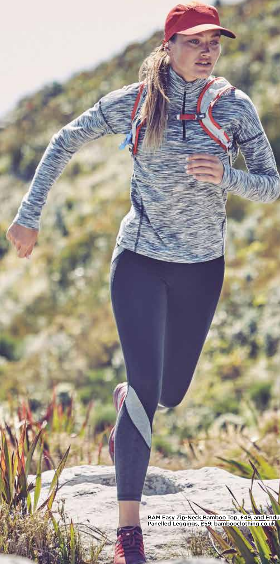
BAM Easy Zip-Neck Bamboo Top, £49, and Enduro Panelled Leggings, £59; bamboclothing.co.uk