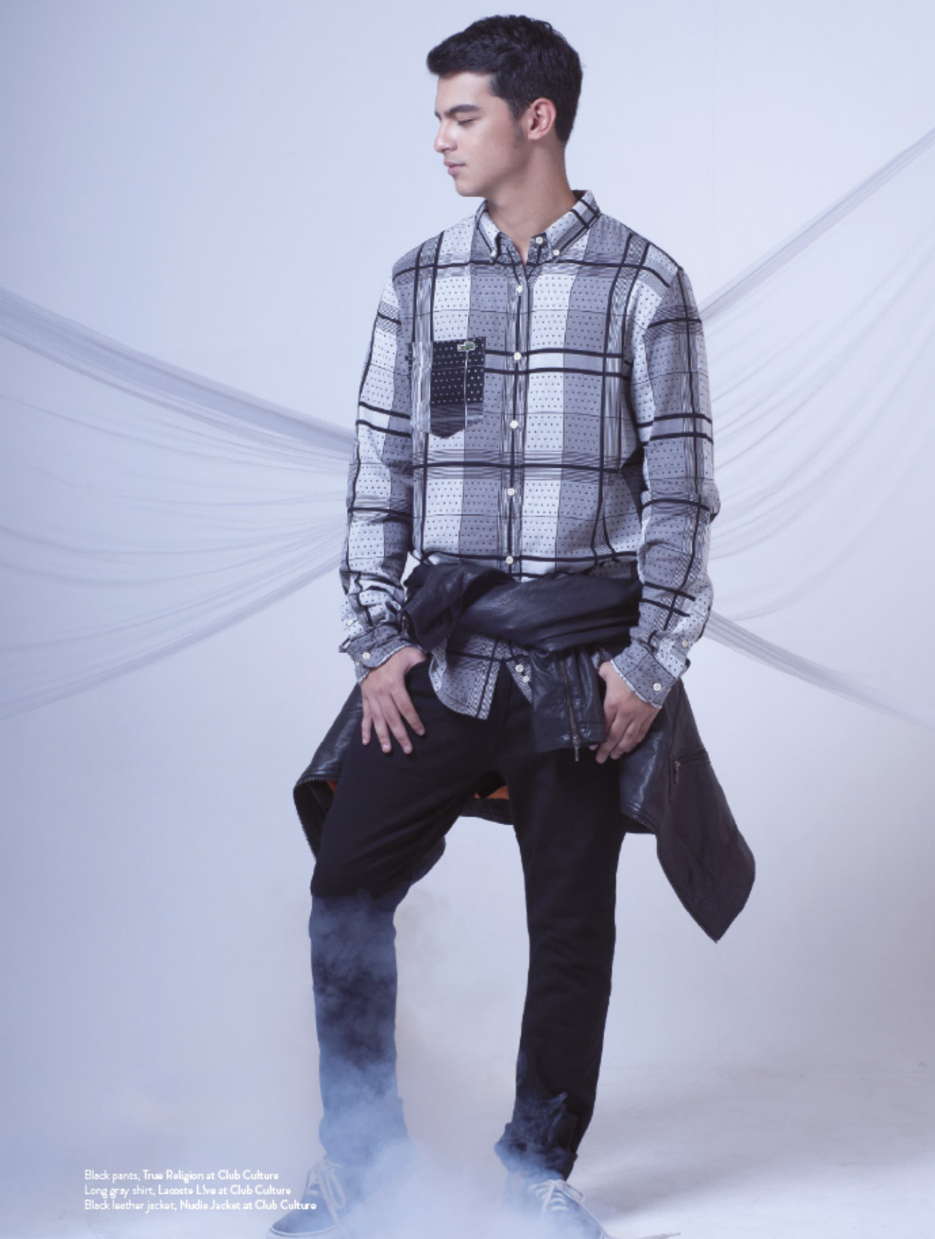
Black pants, True Religion at Club Culture Long gray shirt, Lacoste Live at Club Culture Black leather jacket, Nudie Jacket at Club Culture