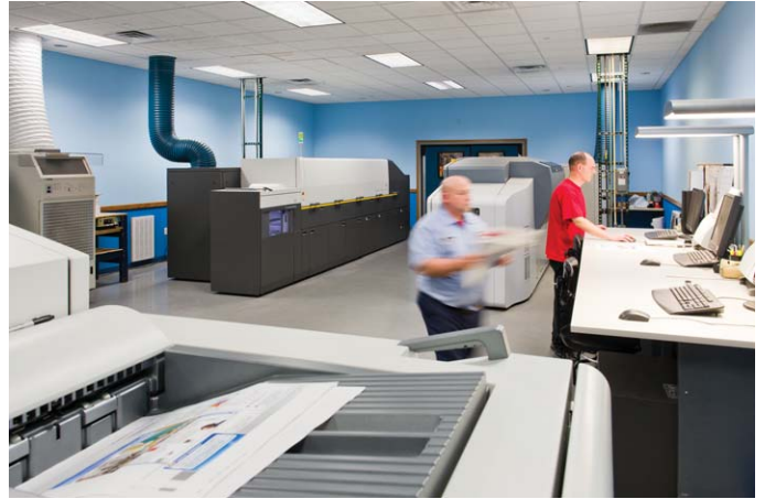
Kodak NexPress digital presses are used for ultra-short print runs.