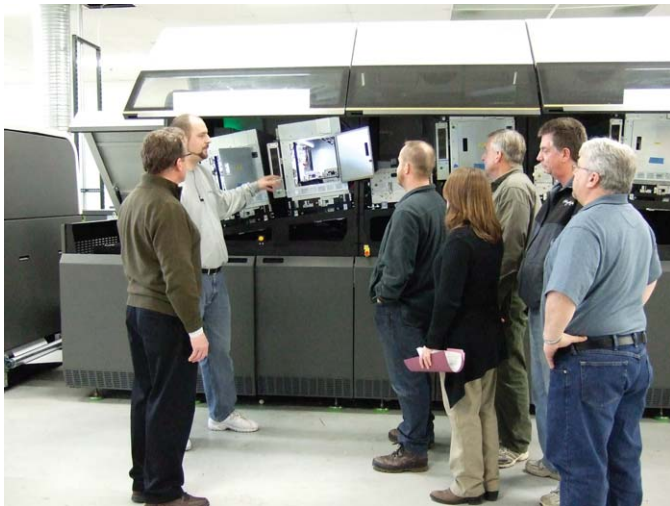
Lean Manufacturing techniques provide opportunities for Webcrafters to enhance the manufacturing process of your important projects.

At Webcrafters our entire staff has been trained in Lean Manufacturing techniques. Webcrafters is continually refining workflows and procedures which have enhanced our continued growth and success in manufacturing B2B and B2C catalogs and publications. As a direct result we have consistently exceeded our customers' expectations by providing unparalleled flexibility and service, exceptional quality and extremely competitive pricing. Lean manufacturing has become an integral part of our corporate culture.