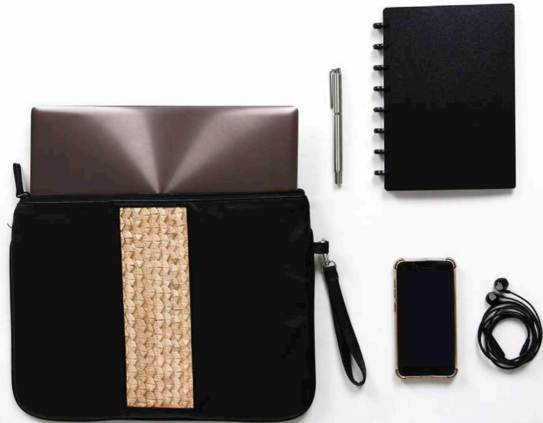
BRAIDED LAPTOP SLEEVE - PLAIN 37 x 1 x 26 cm