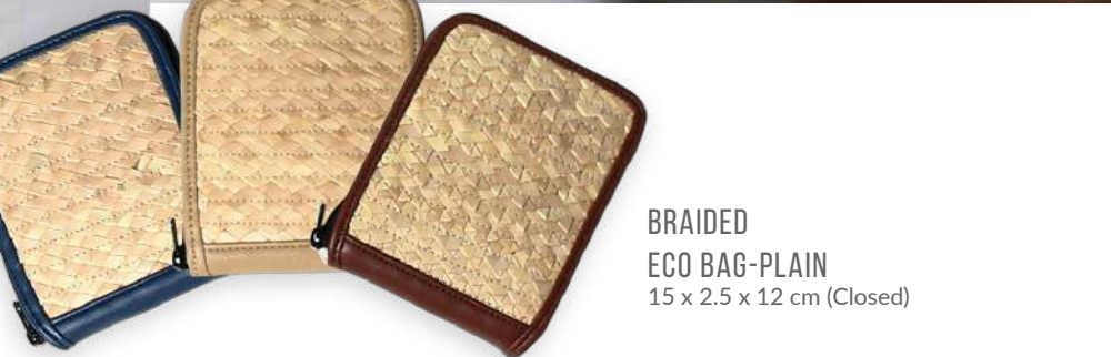
BRAIDED ECO BAG-PLAIN 15 x 2.5 x 12 cm (Closed)