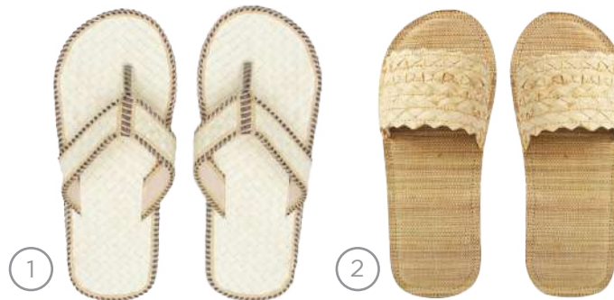
1. WEAFLOPS ZEBRA SLIPPERS