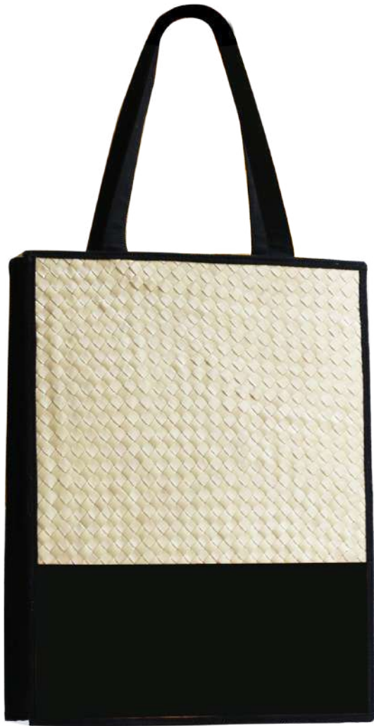
TOTEBAG 007- PELODE PLAIN 28 x 10 x 38 cm