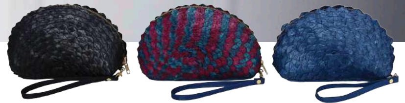
BRAIDED HALFMOON BLACK | PURPLE | NAVY 20 x 7 x 12 cm