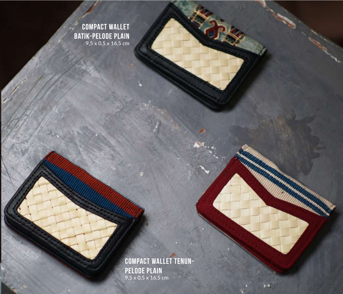
COMPACT WALLET BATIK-PELODE PLAIN 9,5 x 0,5 x 16,5 cm