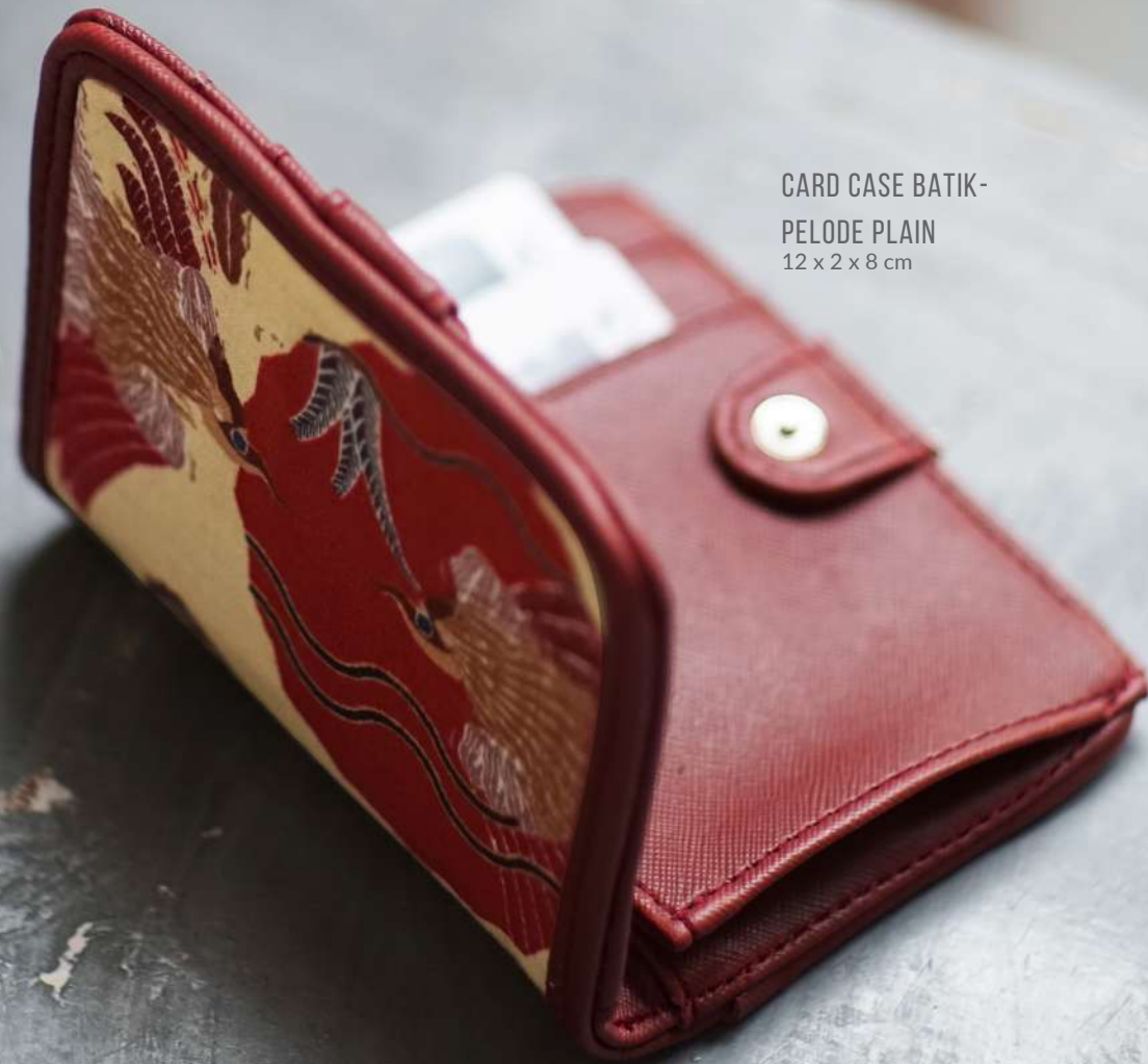
CARD CASE BATIK- PELODE PLAIN 12 x 2 x 8 cm