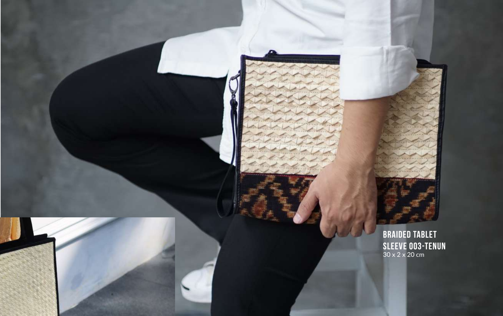
BRAIDED TABLET SLEEVE 003-TENUN 30 x 2 x 20 cm