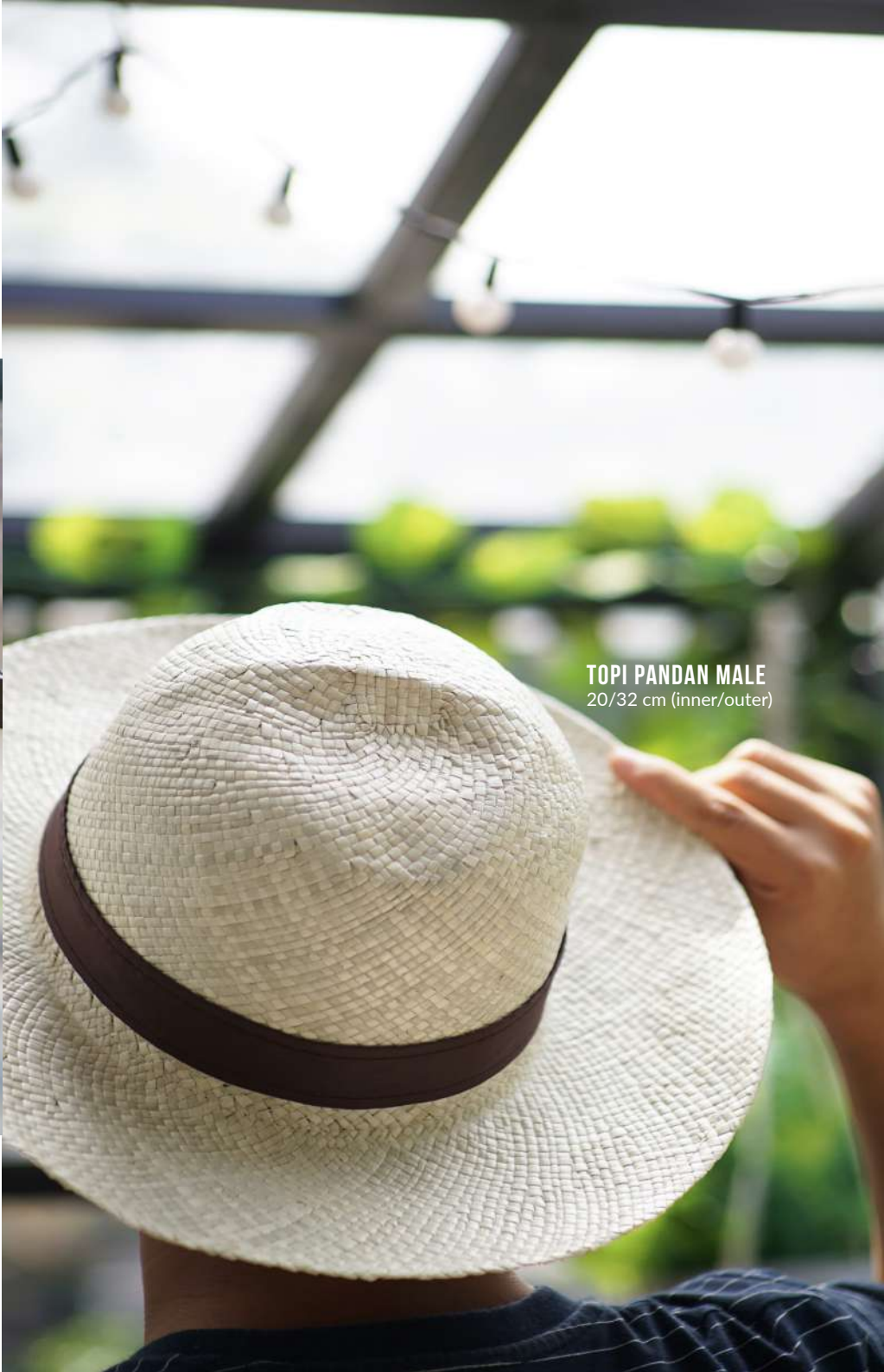
TOPI PANDAN MALE 20/32 cm (inner/outer)