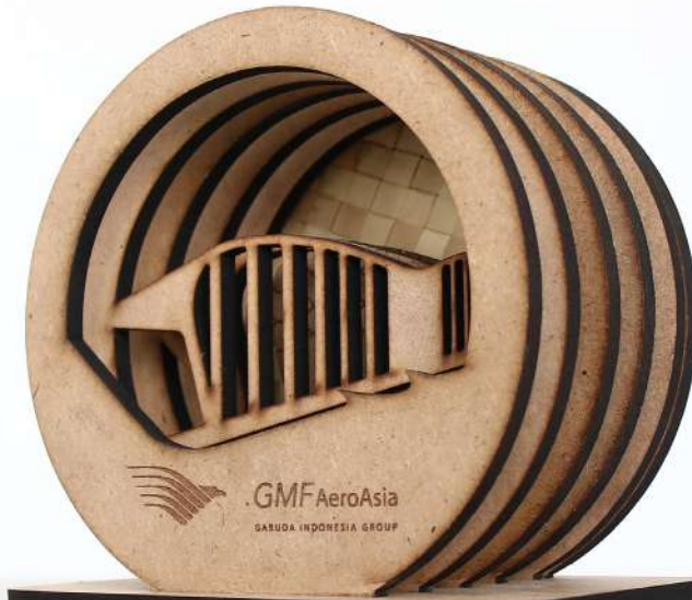
MOMENTO GRAFIR 15 x 11 x 16 cm