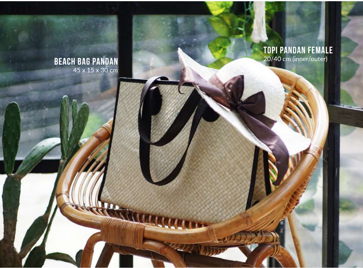
BEACH BAG PANDAN 45 x 15 x 30 cm