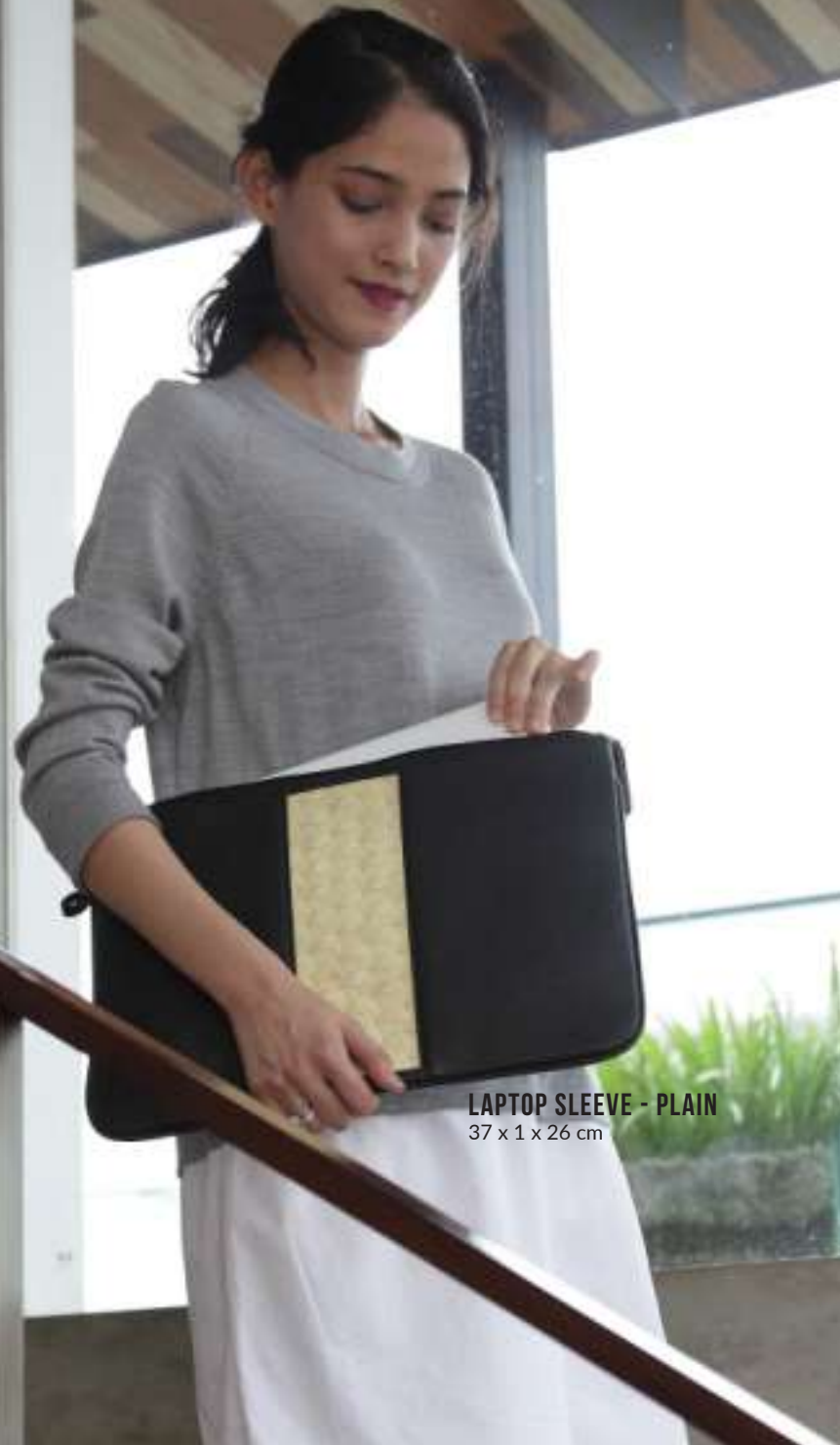
LAPTOP SLEEVE - PLAIN 37 x 1 x 26 cm

Memasuki era Industri 4.0, tetap pilih nuansa natural modern yang sarat ciri khas alami tersendiri. Saatnya bawa disrupti yang elegan dan tampil cemerlang dengan souvenir Du Anyam.