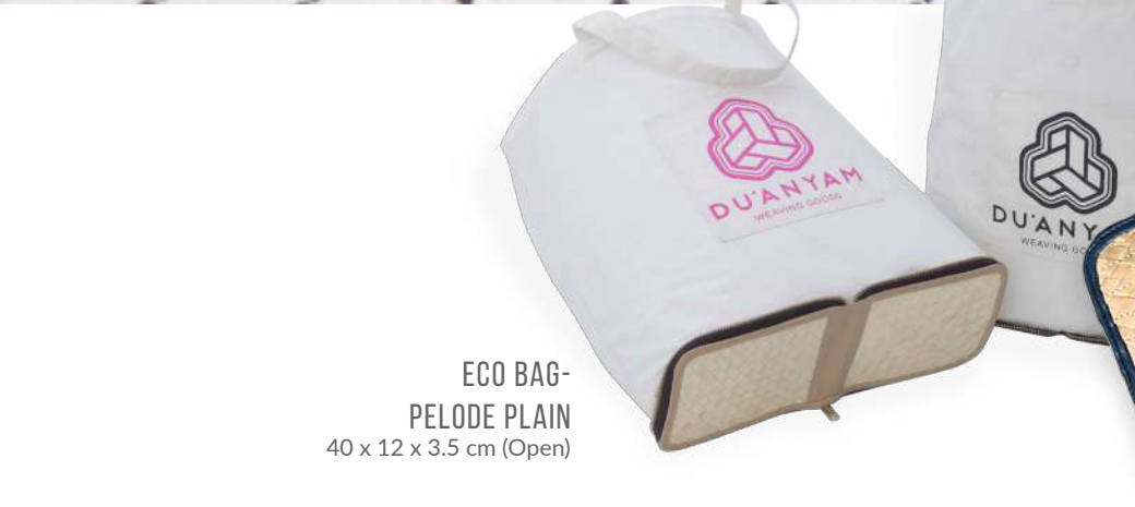
ECO BAG- PELODE PLAIN 40 x 12 x 3.5 cm (Open)