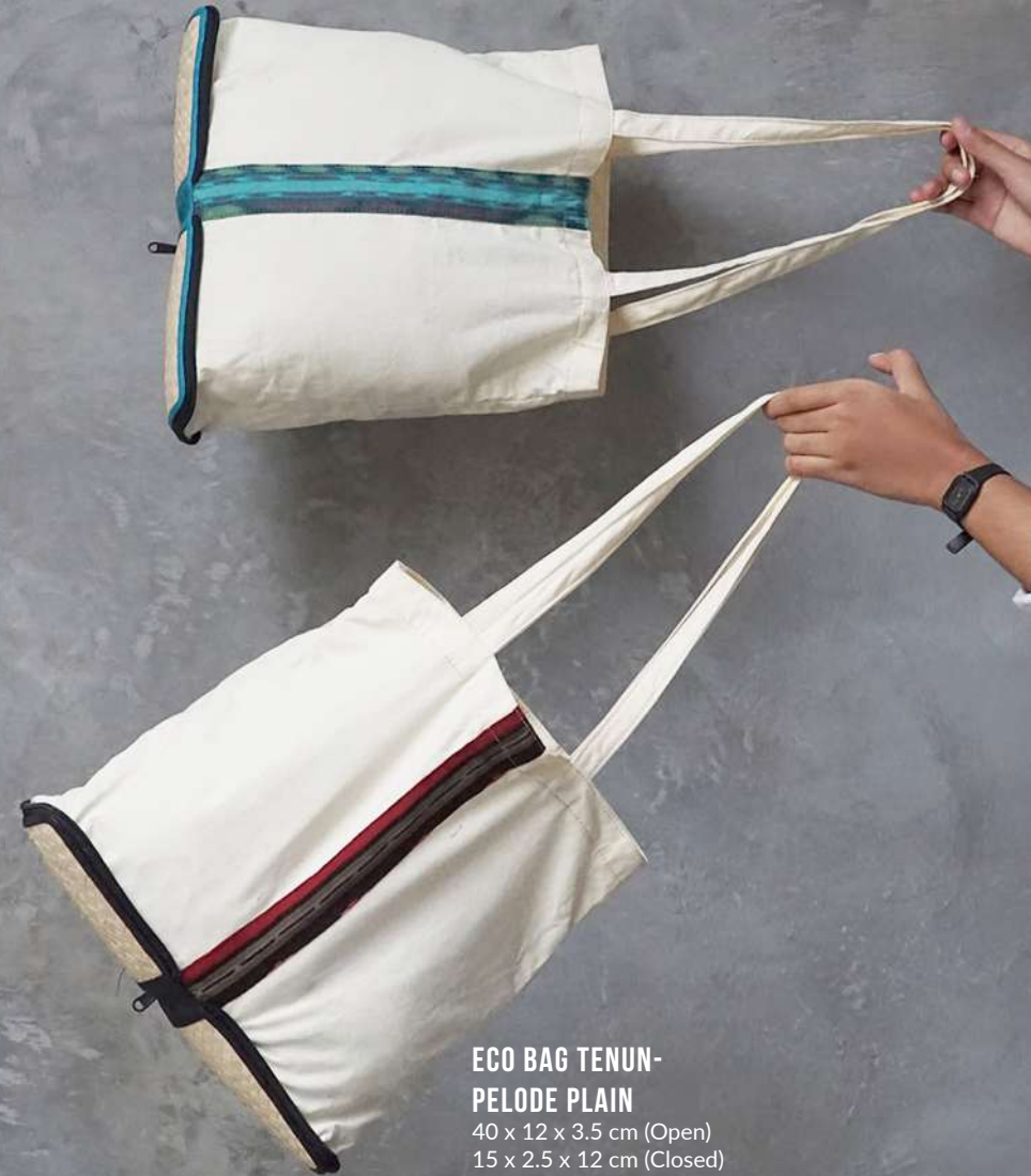
ECO BAG TENUN- PELODE PLAIN 40 x 12 x 3.5 cm (Open) 15 x 2.5 x 12 cm (Closed)