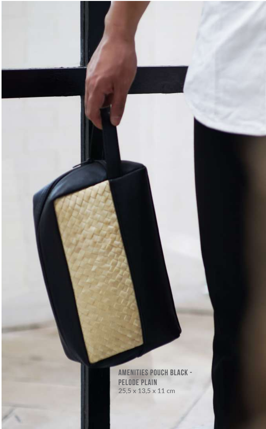
AMENITIES POUCH BLACK - PELODE PLAIN 25,5 x 13,5 x 11 cm