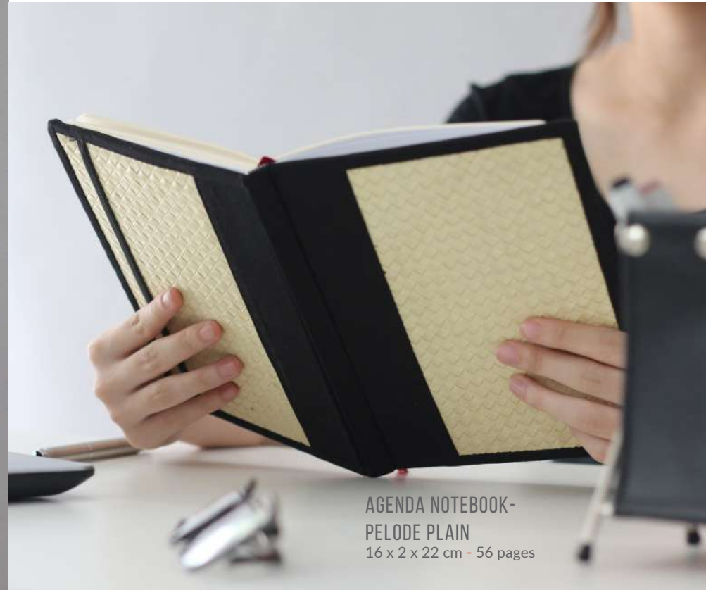
AGENDA NOTEBOOK- PELODE PLAIN 16 x 2 x 22 cm - 56 pages