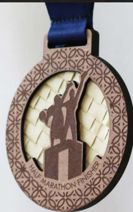
SUSTAINABLE MEDALS Diameter: 10 cm