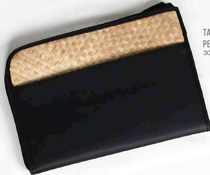
TABLET SLEEVE 002- PELODE PLAIN 30 x 2 x 20 cm