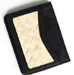
COMPACT WALLET- PELODE PLAIN 9,5 x 0,5 x 16,5 cm