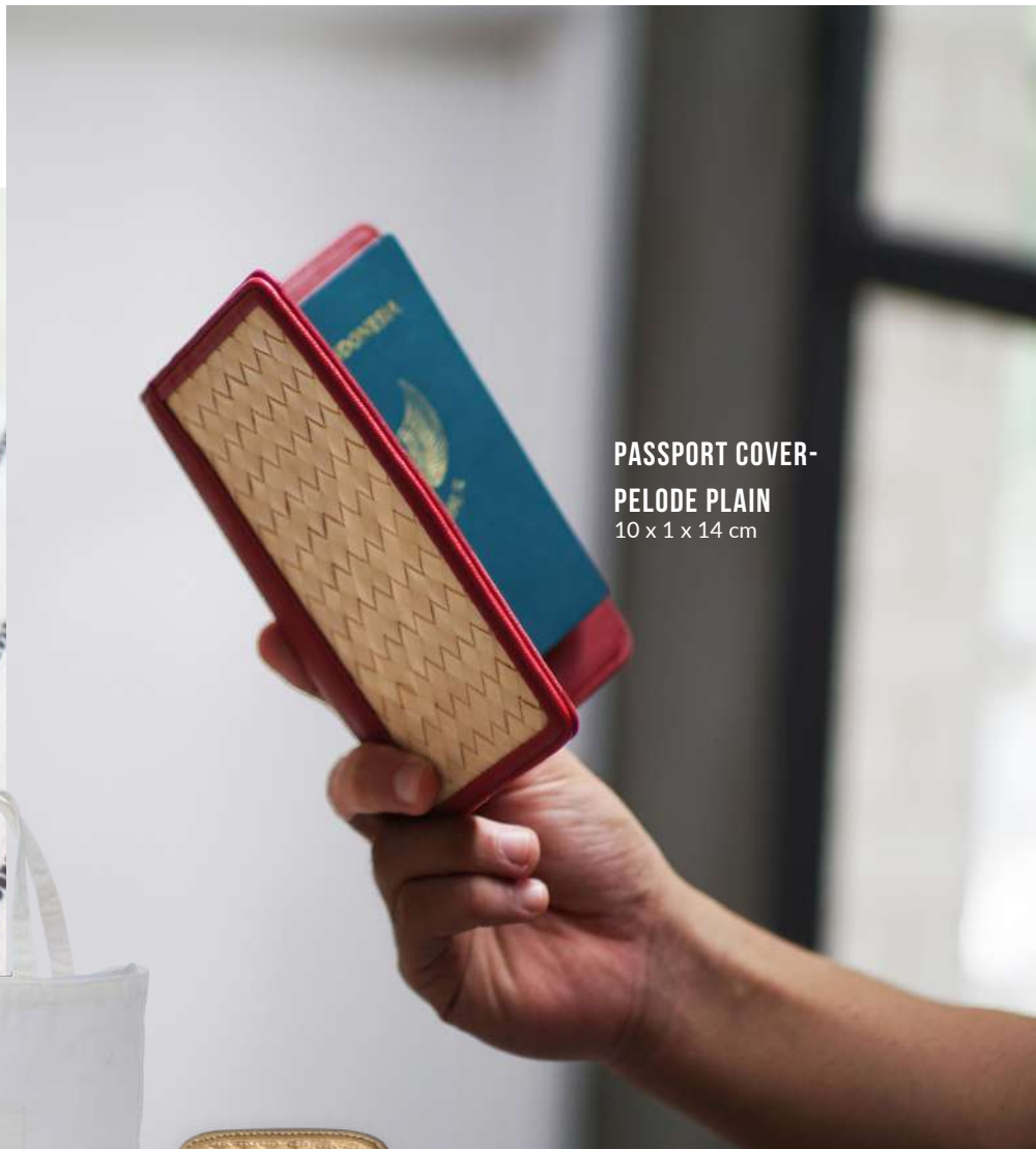
PASSPORT COVER- PELODE PLAIN 10 x 1 x 14 cm