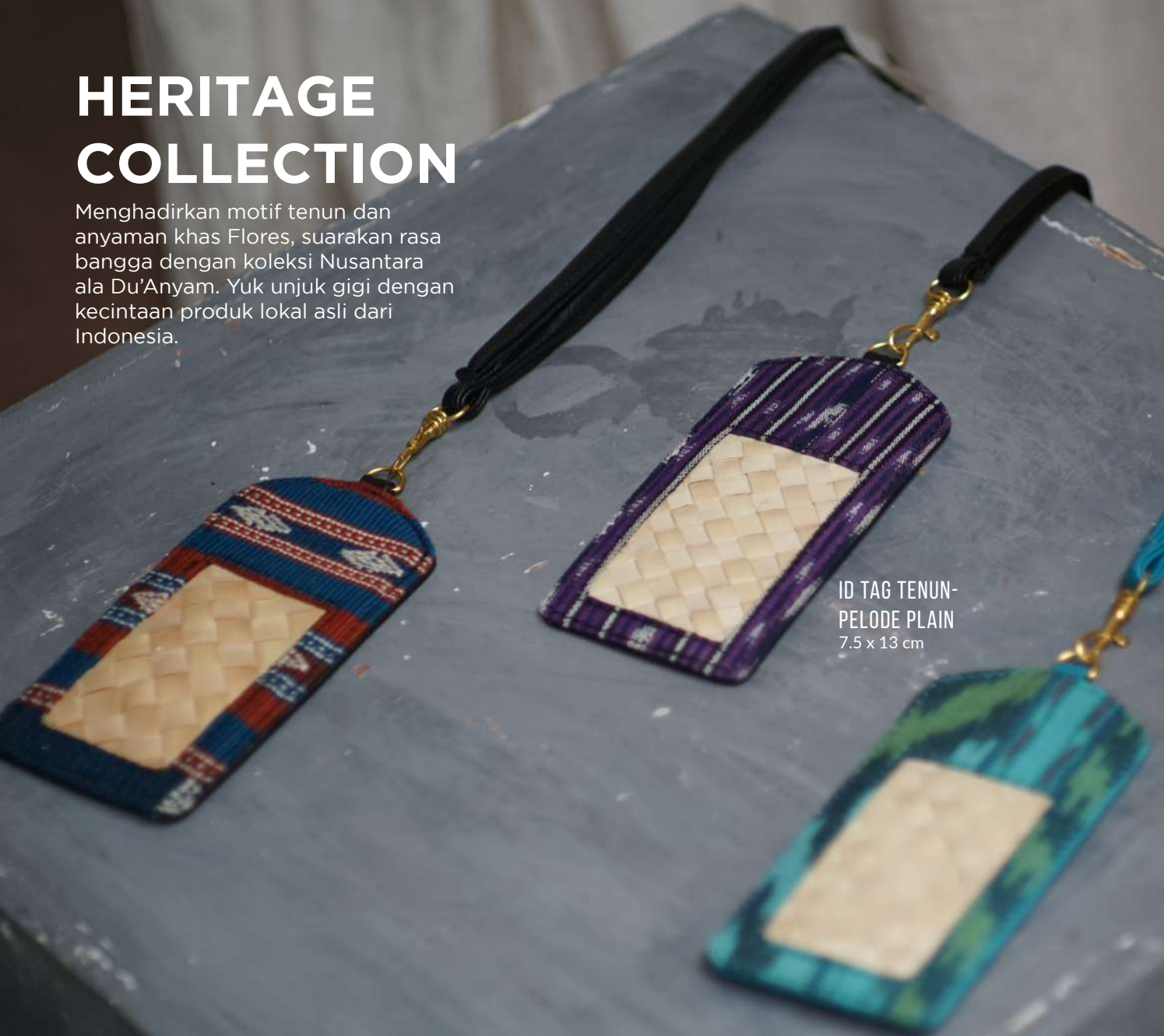
ID TAG TENUN- PELODE PLAIN 7.5 x 13 cm

Menghadirkan motif tenun dan anyaman khas Flores, suarakan rasa bangga dengan koleksi Nusantara ala Du'Anyam. Yuk unjuk gigi dengan kecintaan produk lokal asli dari Indonesia.