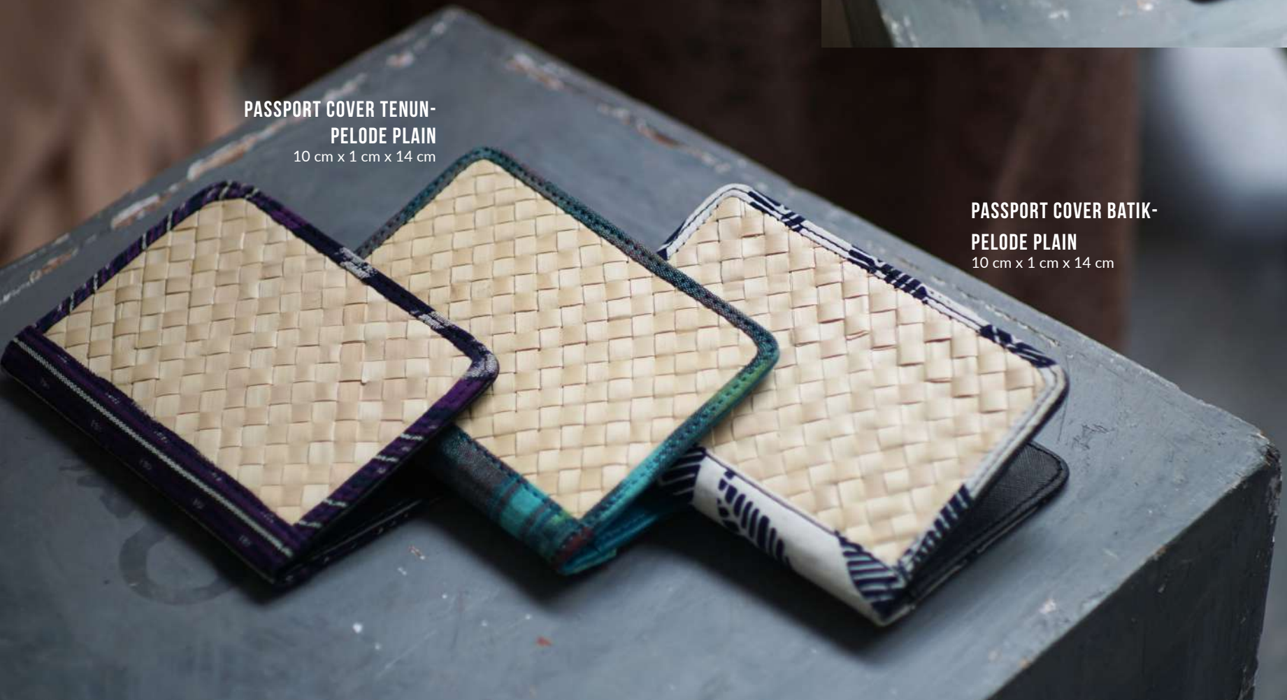
PASSPORT COVER BATIK- PELODE PLAIN 10 cm x 1 cm x 14 cm