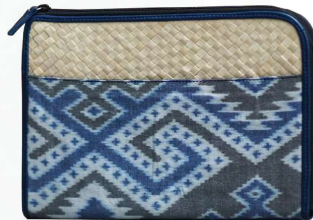
TABLET SLEEVE 002 TENUN- PELODE PLAIN 30 x 2 x 20 cm