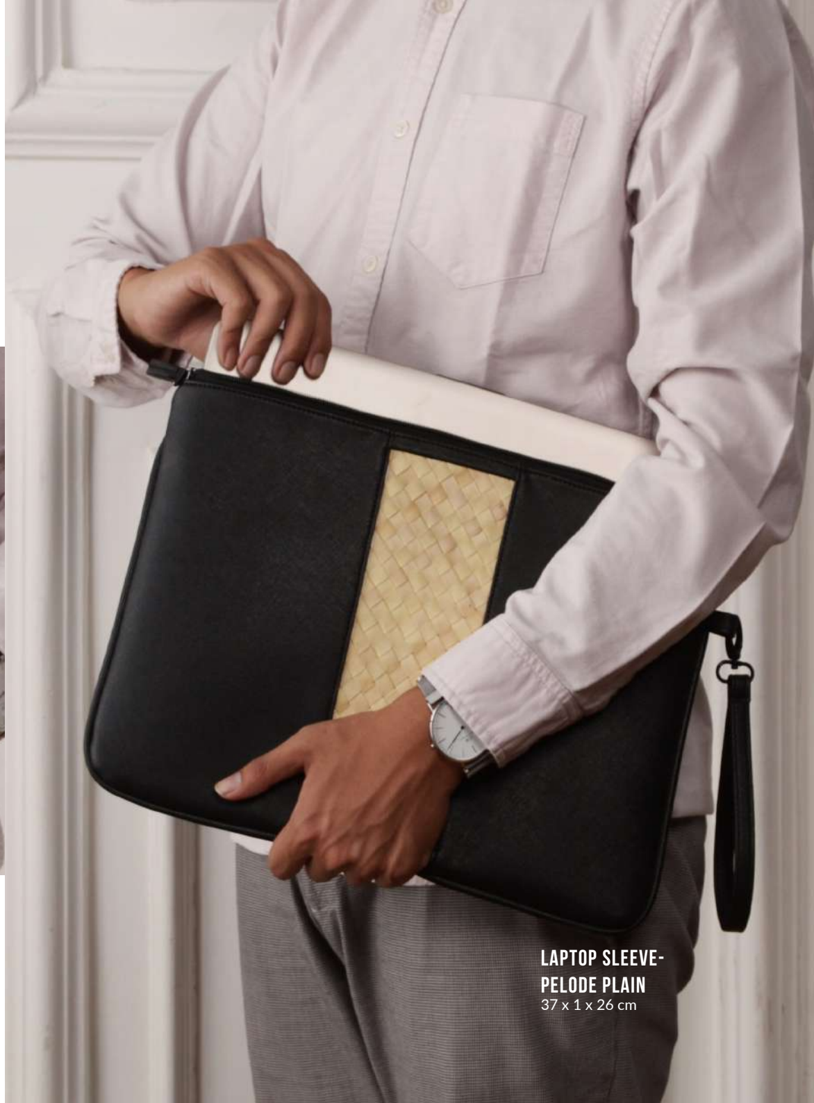
LAPTOP SLEEVE- PELODE PLAIN 37 x 1 x 26 cm