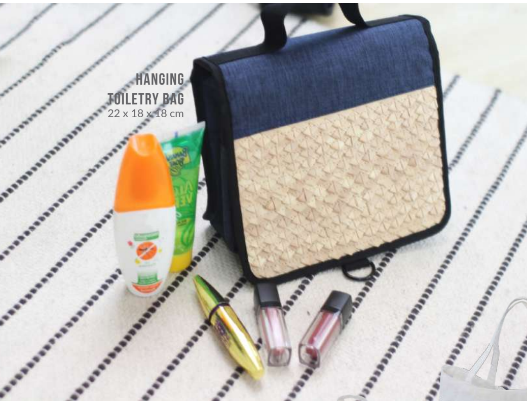
HANGING TOILETRY BAG 22 x 18 x 18 cm