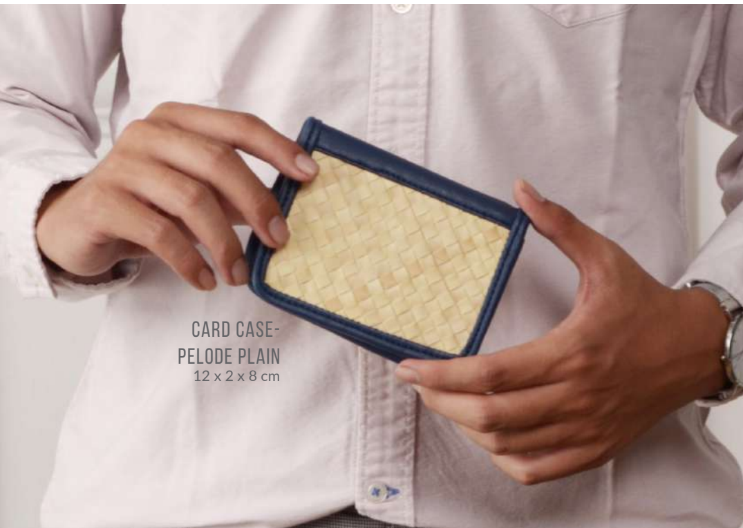
CARD CASE- PELODE PLAIN 12 x 2 x 8 cm