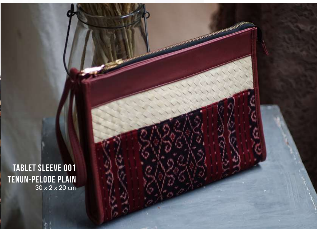
TABLET SLEEVE 001 TENUN-PELODE PLAIN 30 x 2 x 20 cm