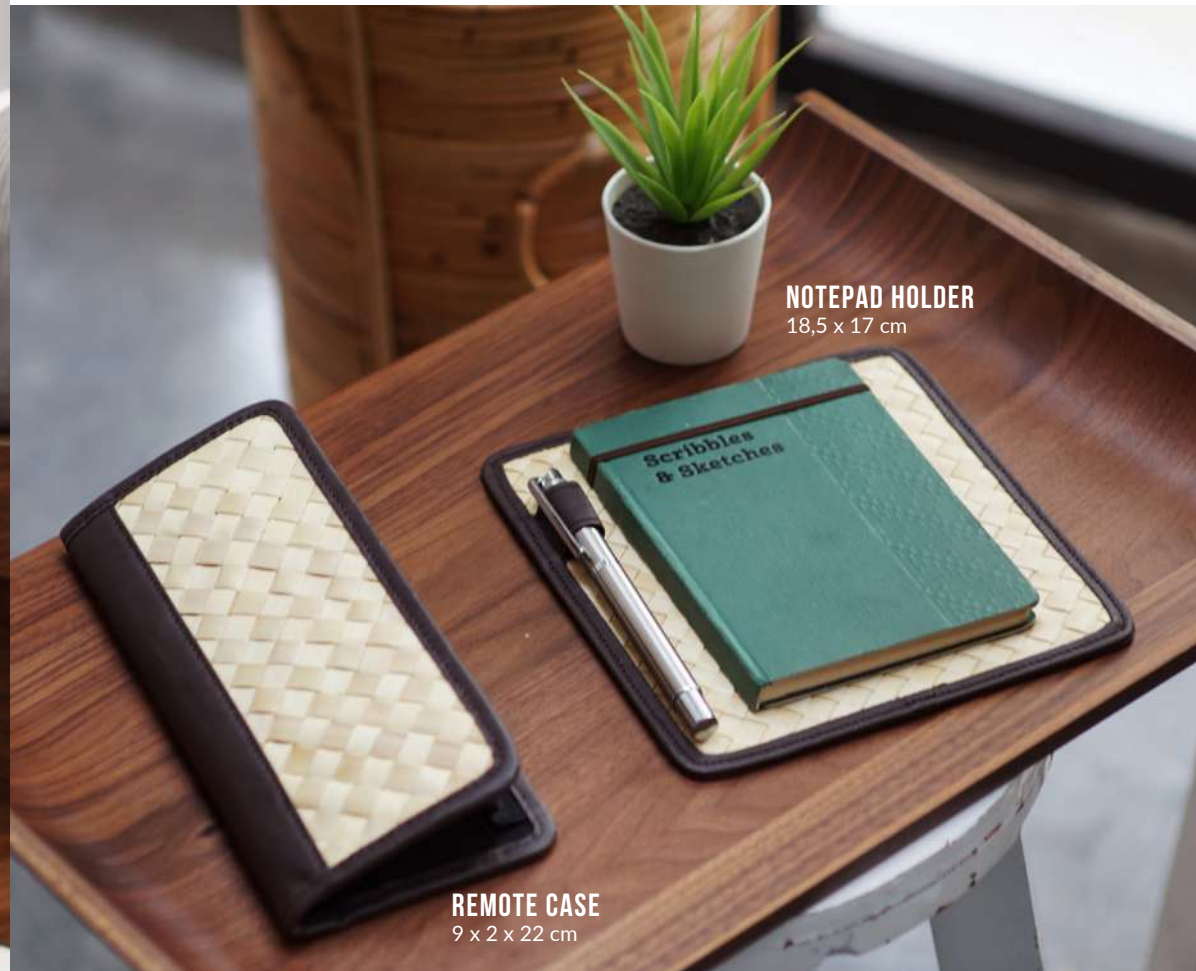
NOTEPAD HOLDER 18,5 x 17 cm