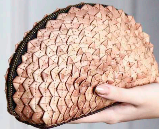
BRAIDED HALFMOON POUCH-TEAK 20 x 7 x 12 cm