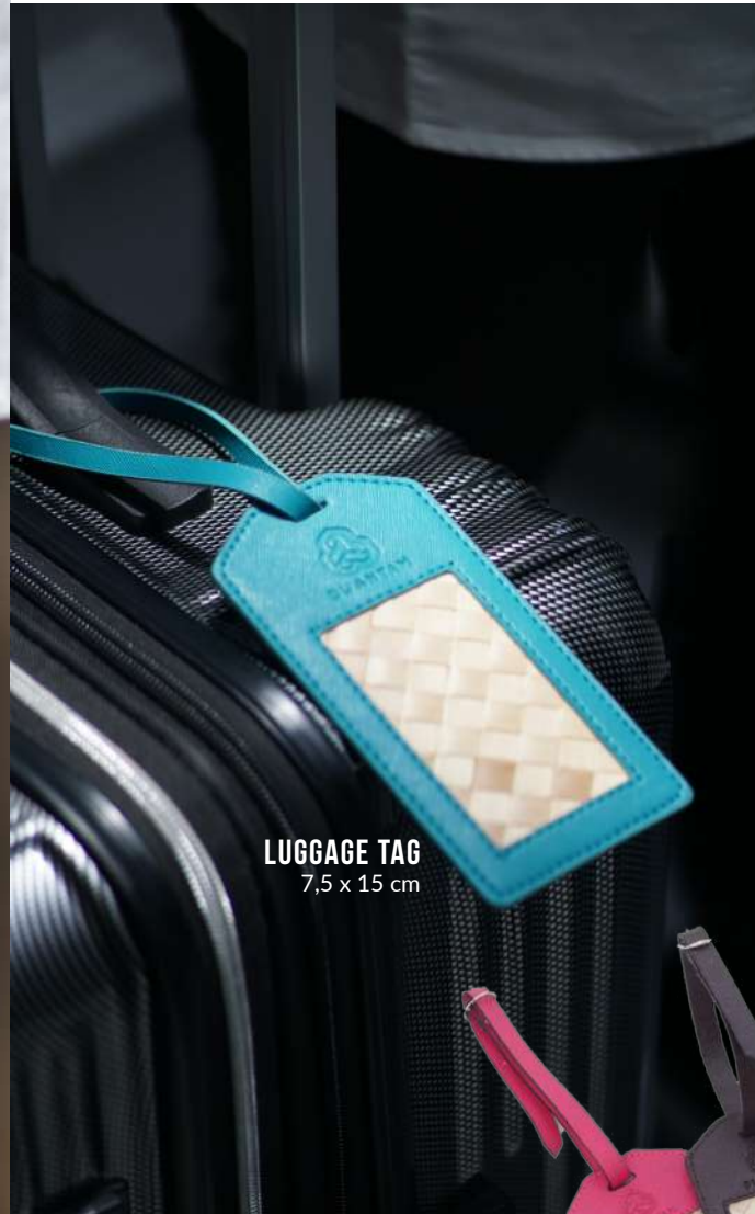
LUGGAGE TAG 7,5 x 15 cm