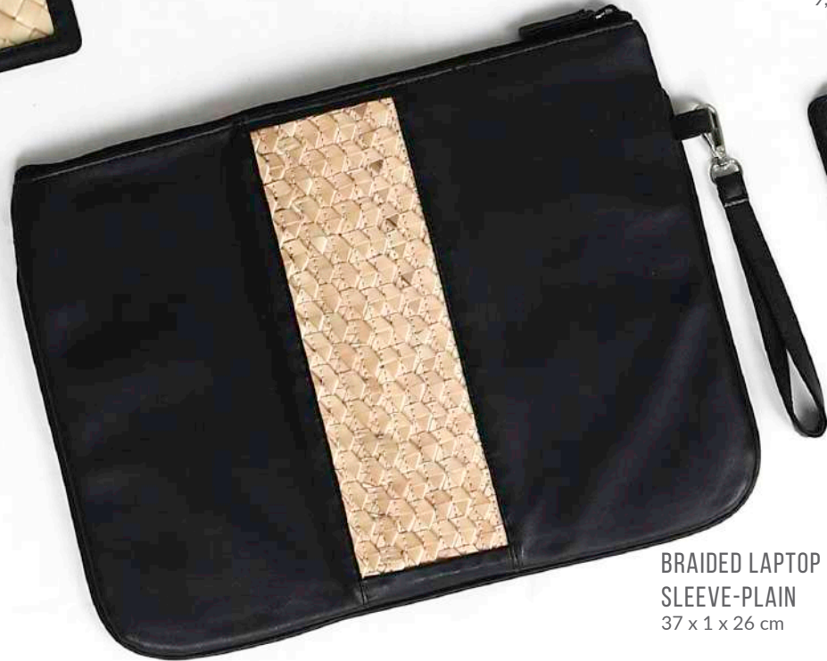
BRAIDED LAPTOP SLEEVE-PLAIN 37 x 1 x 26 cm