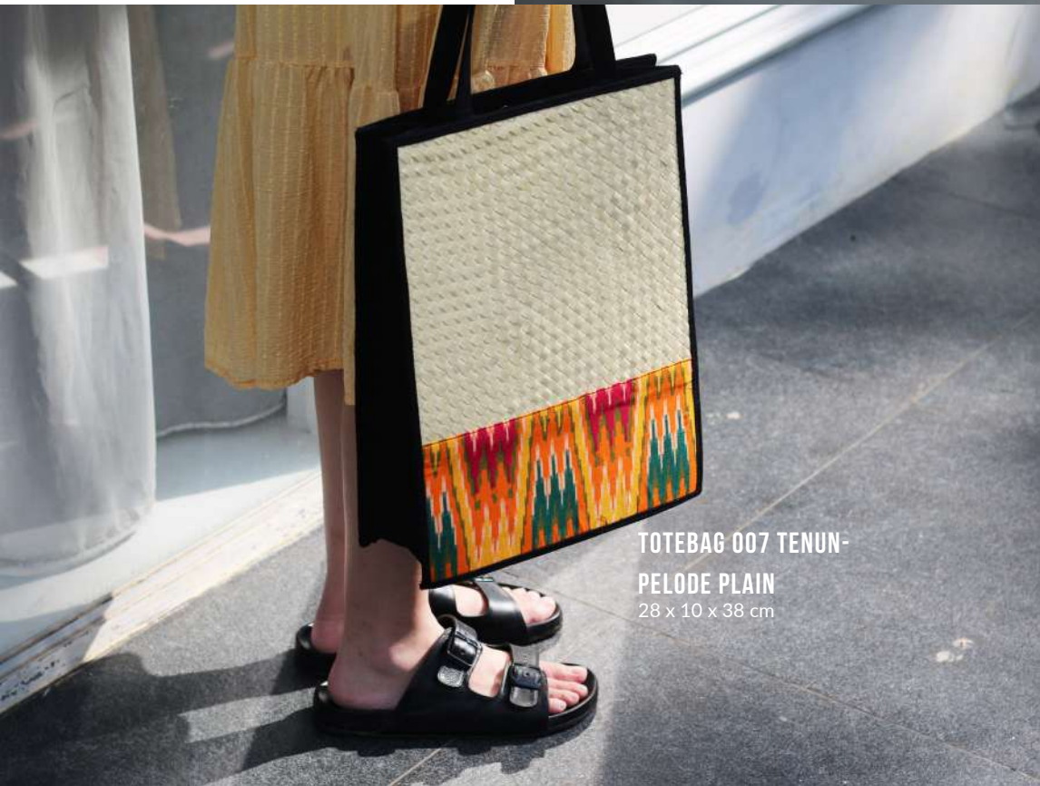
TOTEBAG 007 TENUN- PELODE PLAIN 28 x 10 x 38 cm