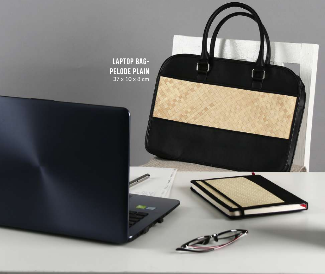
LAPTOP BAG- PELODE PLAIN 37 x 10 x 8 cm

Tampil profesional di rapat tidak harus kaku atau membosankan. Saatnya mencuri perhatian dengan koleksi souvenir kantor Du'Anyam yang punya twist dan keunikan tersendiri.