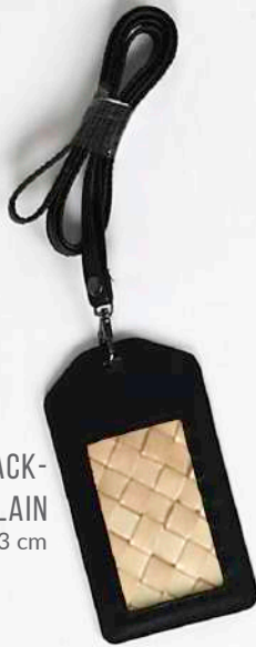
ID TAG BLACK- PELODE PLAIN 7,5 x 13 cm