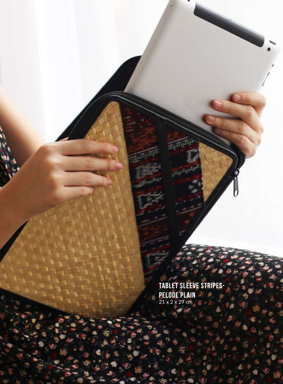
TABLET SLEEVE STRIPES- PELODE PLAIN 21 x 2 x 29 cm