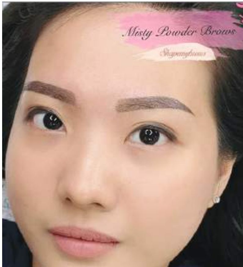
Last up to 2 years

Ombre or Misty Eyebrow Embroidery is a semi - permanent solution with a softer and fresher look. The colors are darker on the tails then fade to lighter shade towards the beginning, giving it a highly-defined and elegant finish.