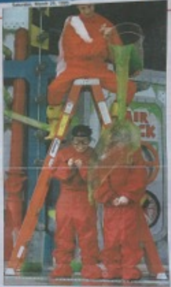
A person in a red jumpsuit stands on a structure at Splat City's opening.

Splat City - The event, which is open to all ages, is a fun way to get out of the rain and into a world of ooze. The event, which is open to all ages, is a fun way to get out of the rain and into a world of ooze.