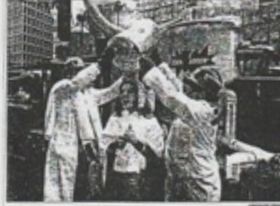
"Tonight" was the highlight... "It will be..."