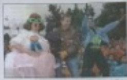
(Left) A woman in a pink costume and (right) a man in a blue costume at Splat City's opening.