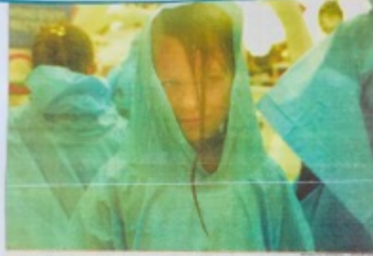
A person in a green jumpsuit is at Splat City's opening.