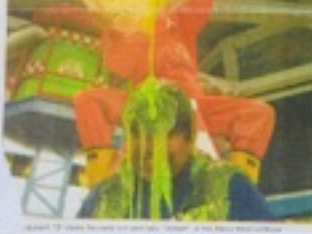
A person in a red jumpsuit is at Splat City's opening.

Anything you so really need to do is get out of the rain and into a world of ooze.