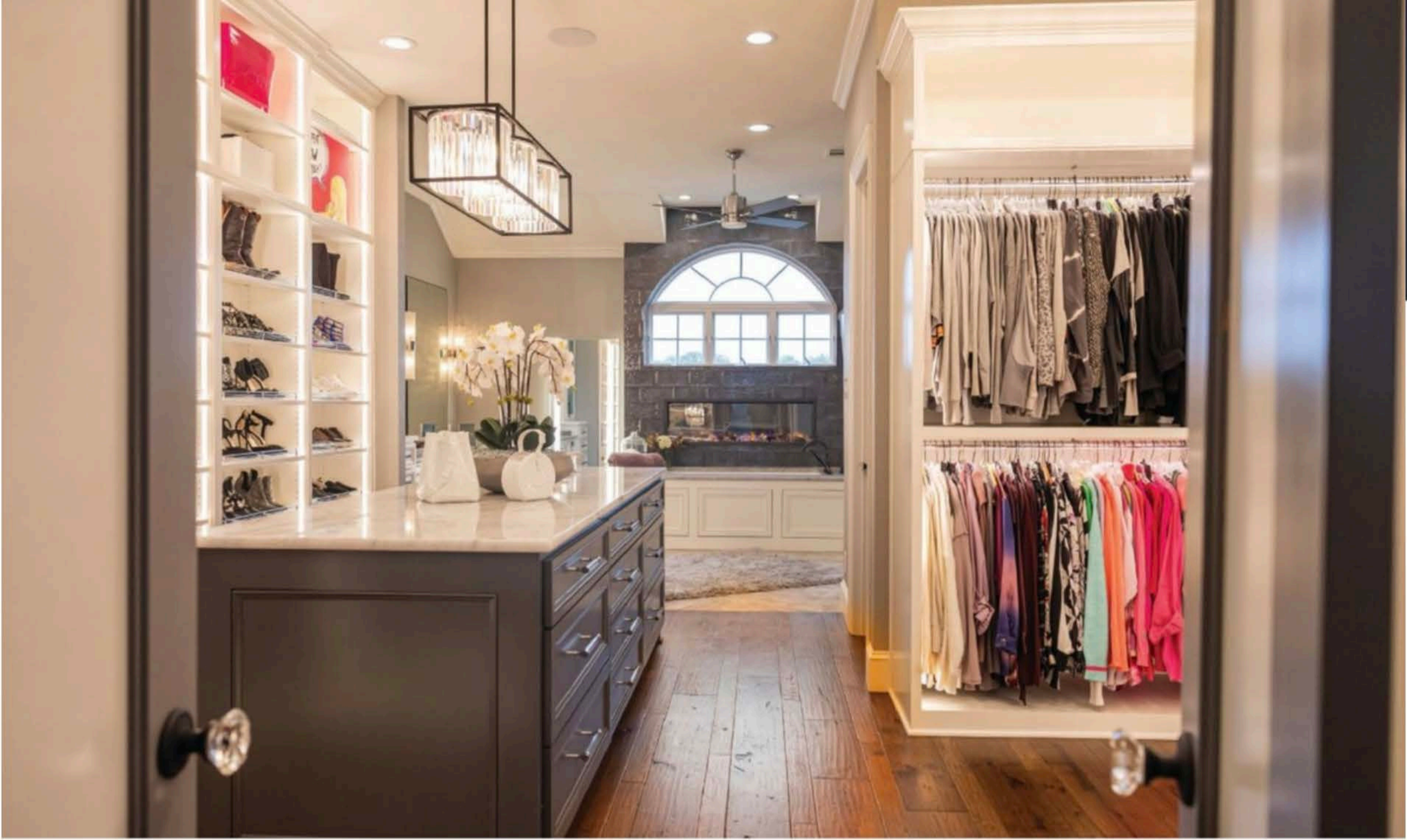
Top: The closet connects the bedroom to the primary bathroom where a gas fireplace and TV are mounted over the bathtub, allowing the homeowner to relax in the ambiance. Bottom: White cabinets replaced the brown that was in the space previous, giving the area a sleek and contemporary design while also brightening the room.