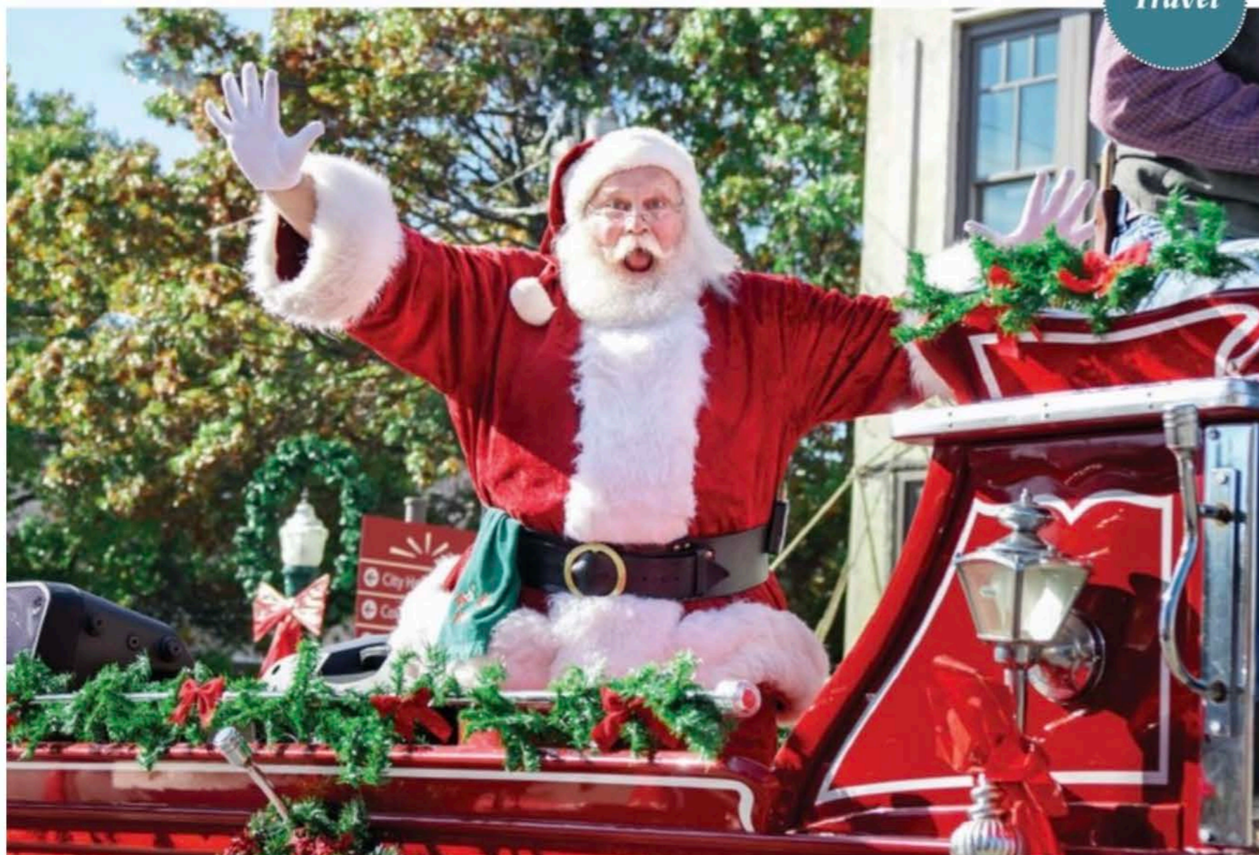
Santa makes a special trip to Georgetown every holiday season for the annual Christmas Stroll.

S ure you've passed through many times on your way to Austin or maybe you visited on a class trip to explore Inner Space Caverns, but if you haven't taken time to hang out in the town that boasts the "most beautiful town square in Texas," and which was recently named the "Texas Heartland's Most Underrated Destination" by thetravel.com (June 2022), this holiday season might be just the right occasion.