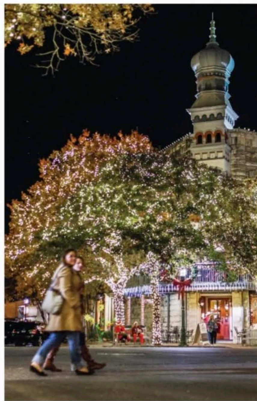
Left to right, top to bottom: Left to right, top to bottom: Sip and shop at Mesquite Creek Outfitters, with 16 Texas craft beers on tap and an assortment of men’s and women’s apparel. The town square between Austin Avenue and Main Street are covered in lights for the holidays, from every building to every tree. Breweries like Barking Armadillo Brewery offer tasting flights for beer enthusiasts just outside of downtown while Barons Creek Vineyards offers wine testing while soaking up the holiday magic.