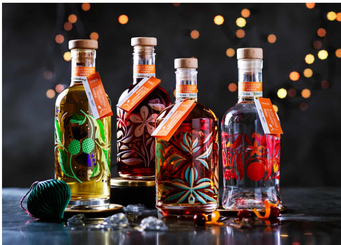
M&S sloe gin, Madagascan vanilla rum spirit drink, blood orange and cranberry vodka