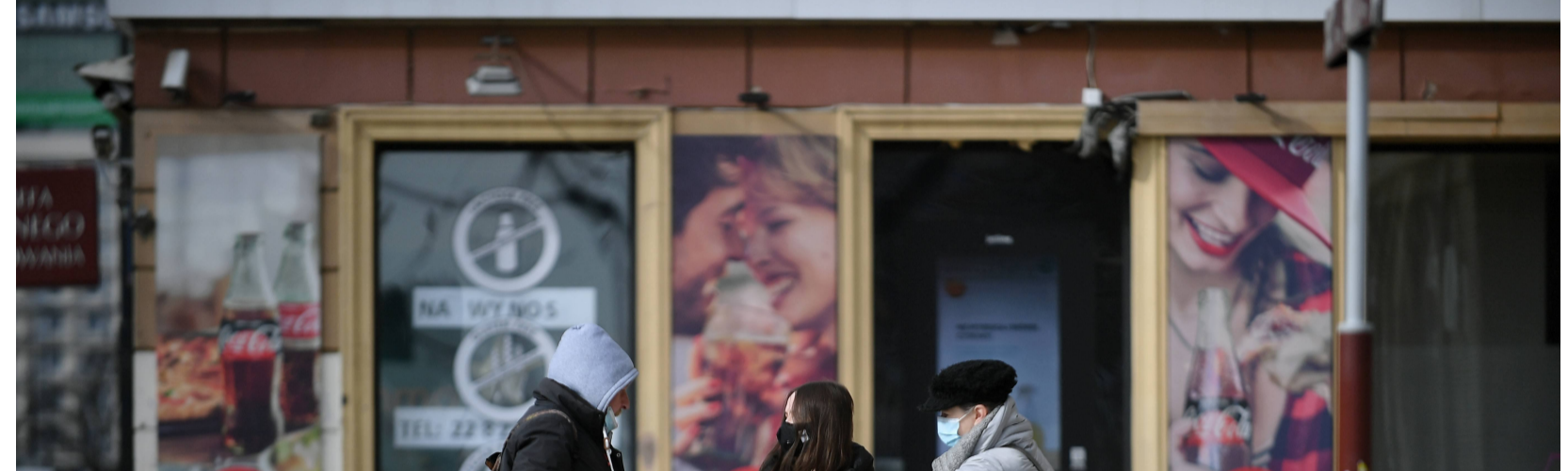
The purpose is to protect the centre from 'tacky adverts', meaning shop windows will not be able to be covered with advertisements, and stores will be prohibited from spilling out freely onto pavements.

The park's boundaries include the Old and New Town, the Royal Route along Krakowskie Przedmieście, Nowy Świat and Ujazdowskie avenue, Krasinski and Saski gardens with the area between them, and the green areas below the Vistula escarpment including the Royal Baths Park.