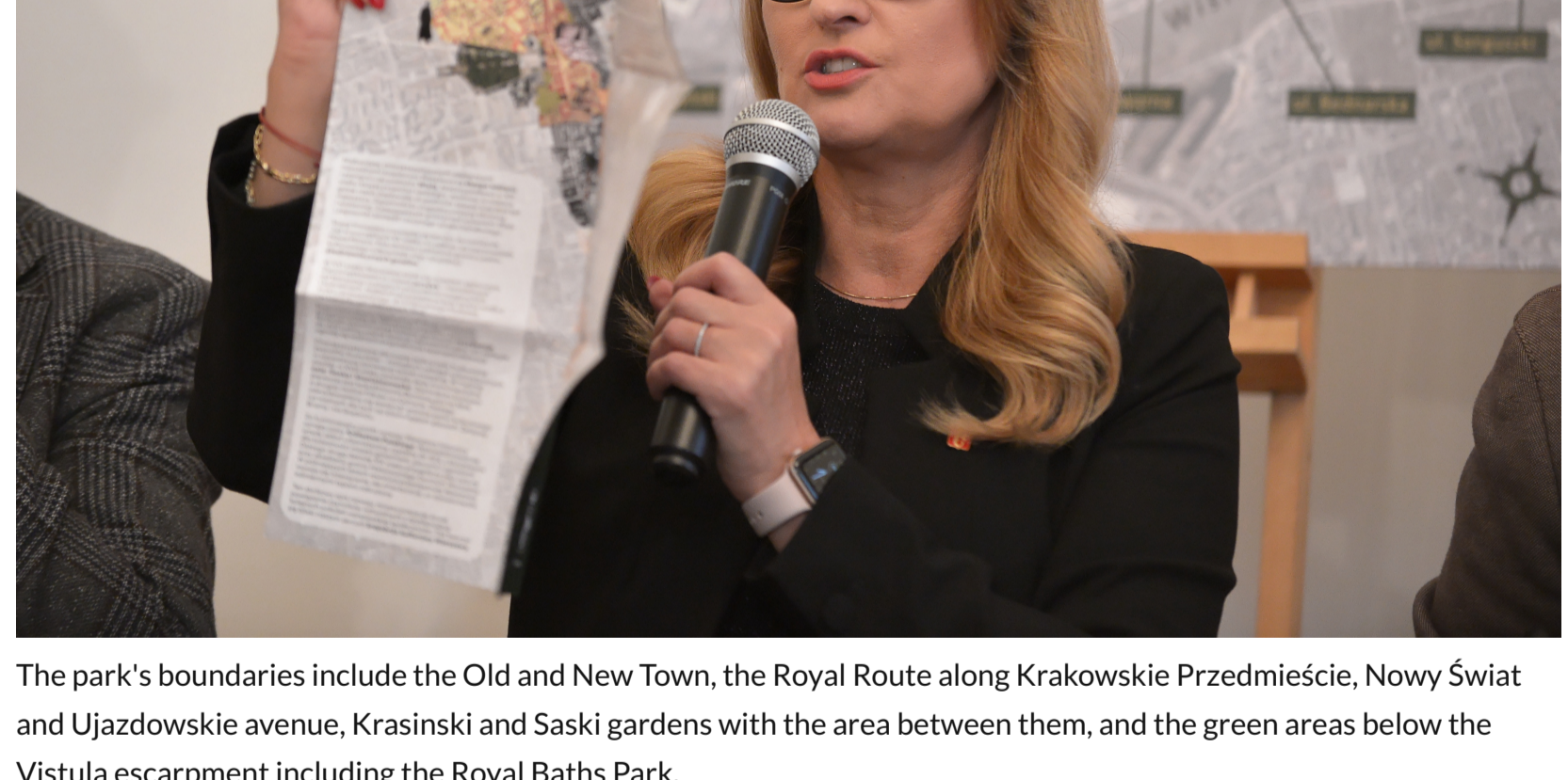
The park's boundaries include the Old and New Town, the Royal Route along Krakowskie Przedmieście, Nowy Świat and Ujazdowskie avenue, Krasinski and Saski gardens with the area between them, and the green areas below the Vistula escarpment including the Royal Baths Park.

Culture parks are envisaged as a tool to strike a delicate balance between the interests of tourists, residents, and the imperative to preserve historical sites.