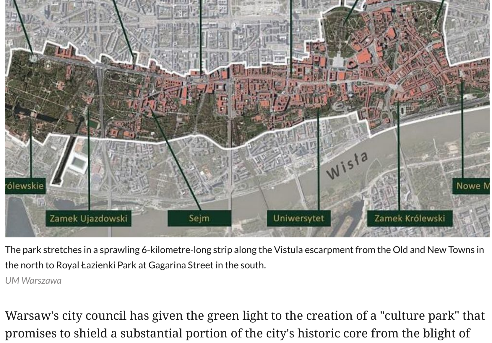
The park stretches in a sprawling 6-kilometre-long strip along the Vistula escarpment from the Old and New Towns in the north to Royal Łazienki Park at Gagarina Street in the south.