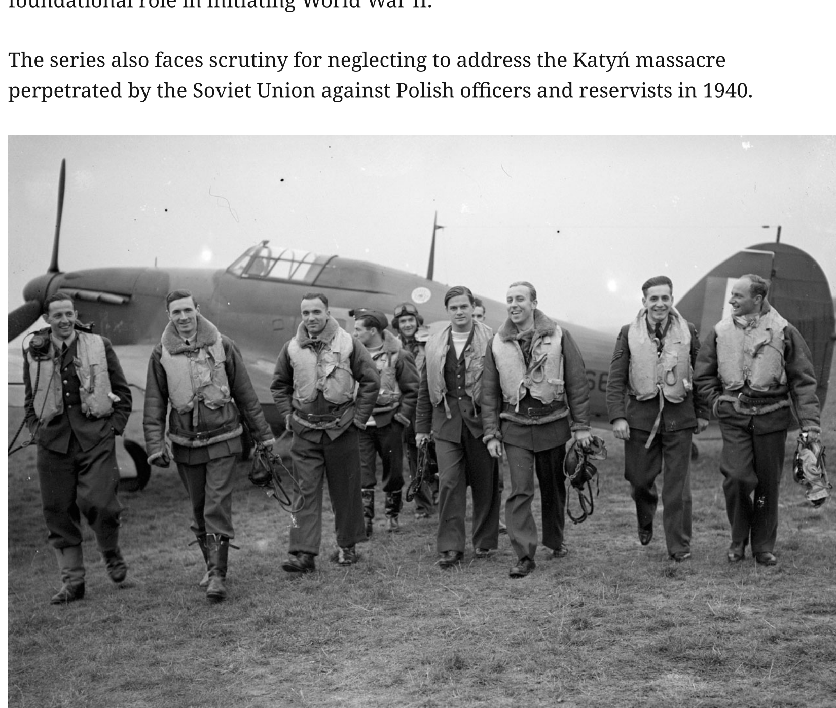
Additionally, the documentary fails to highlight the pivotal role played by the Polish 303 Squadron during the Battle of Britain in 1940.

The series also faces scrutiny for neglecting to address the Katyń massacre perpetrated by the Soviet Union against Polish officers and reservists in 1940.