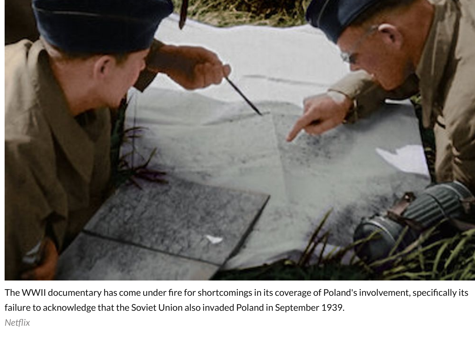
The WWII documentary has come under fire for shortcomings in its coverage of Poland's involvement, specifically its failure to acknowledge that the Soviet Union also invaded Poland in September 1939.