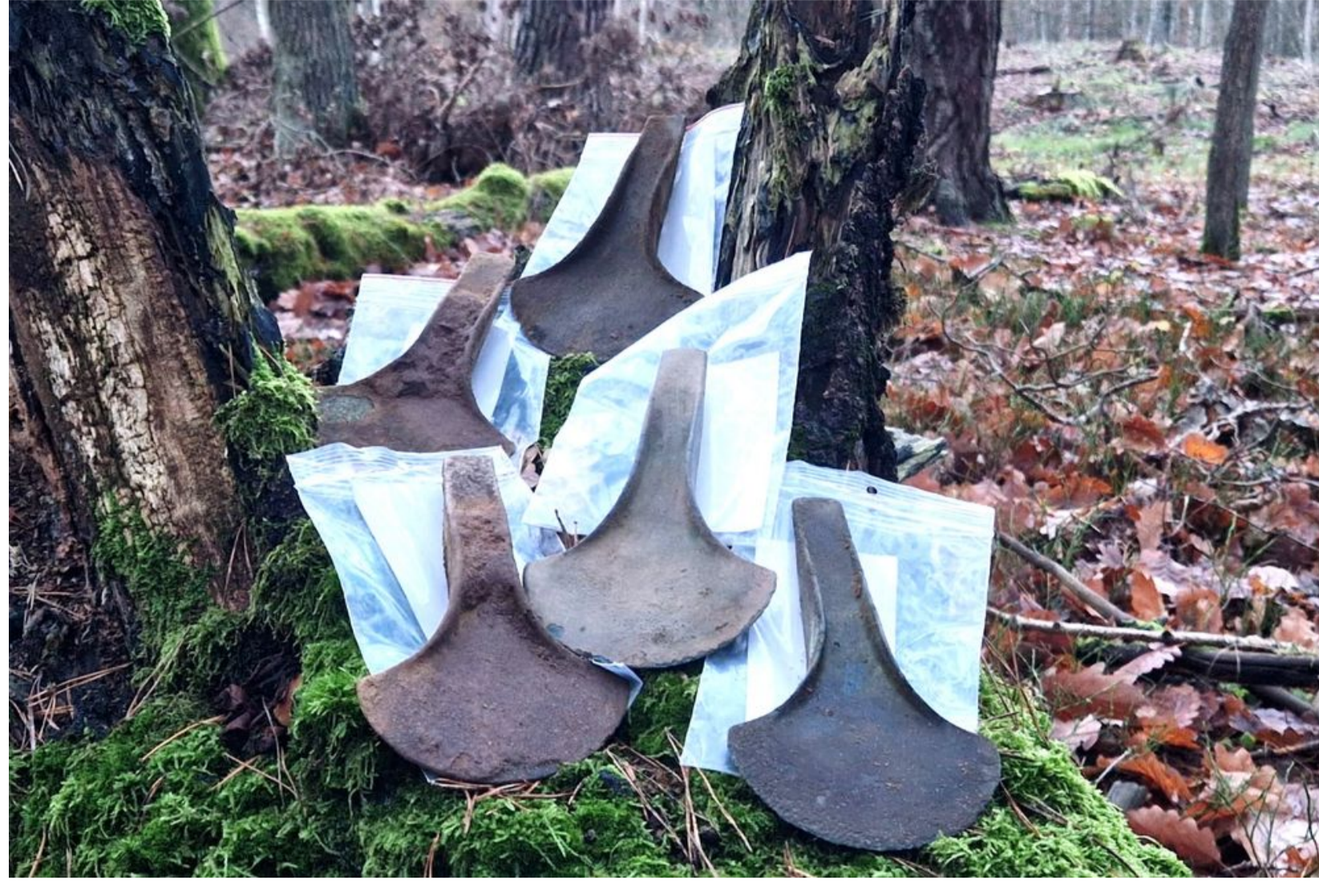
With Bronze Age deposits in the region consisting mainly of bracelets or breastplates, the discovery of the axe heads have been described as a distinctive archaeological marvel.