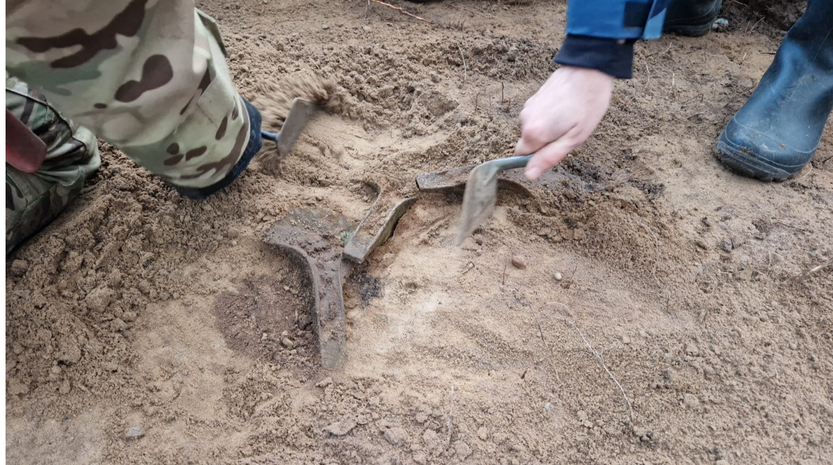
The discovery was made by an amateur treasure hunter in the Starogard forest near Szczecin.

Described by foresters in the Starogard Forest District as 'sensational', the discovery by an amateur treasure hunter date from between 1700 and 1300 BC according to Igor Strzok, the Pomeranian Provincial Conservator of Monuments.