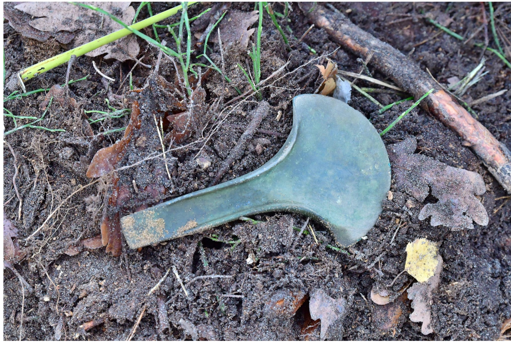
Characterised by their substantial size, the axes comprised a slender handle with elevated edges and a broad blade.