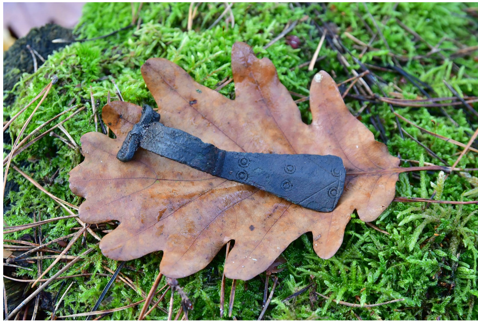
The last find of this type was discovered about 20 years ago in the Lublin region.

"The last find of this type of weapon or tool was discovered about 20 years ago in the Lublin region.