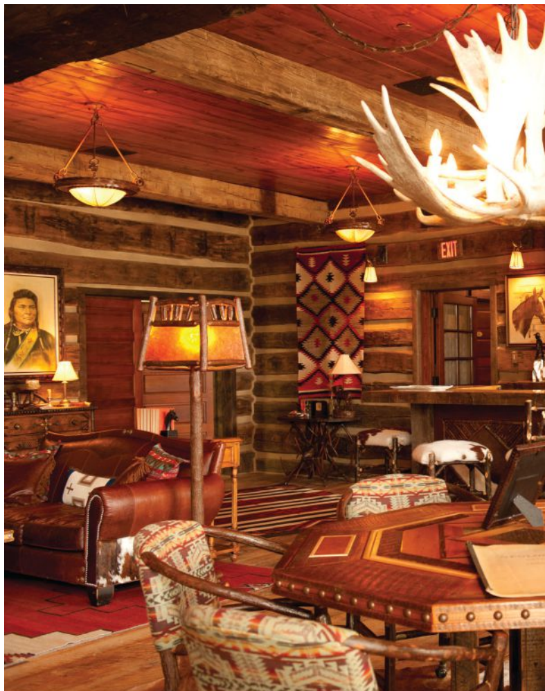
(clockwise from above) Ponderosa pine floors and a claw-foot bathtub in one of the spacious bedrooms. The richly furnished Great Room of the Granite Lodge functions as lounge and reception area. All meals, drinks and snacks are included in the ranch's daily rates. Granite Lodge as seen from outside looking toward the ground-floor spa, which offers hot stone massages and sagebrush scrubs.