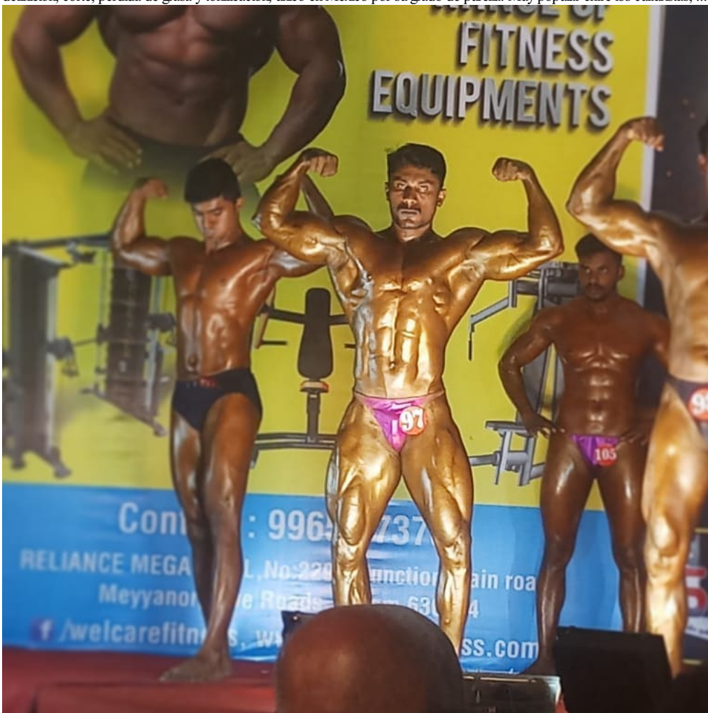
Never be afraid to go for everything it is you want out of life! People always ask me how I got to where I am, ask for advice on how to get there themselves and it's as simple as