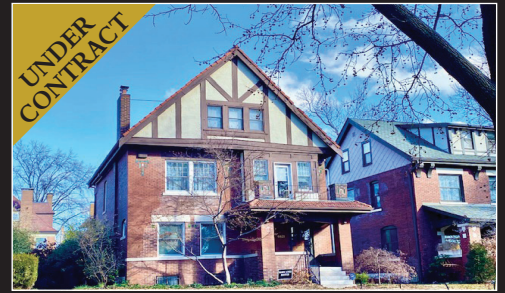
4431 McPherson Avenue List Price: $$575,000