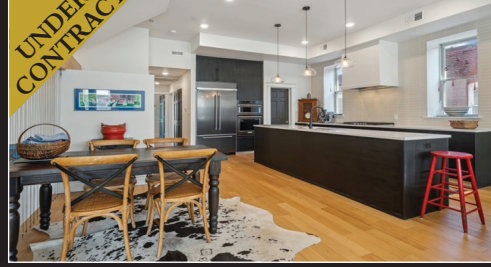
4237 Laclede Avenue, Unit B List Price: $597,500