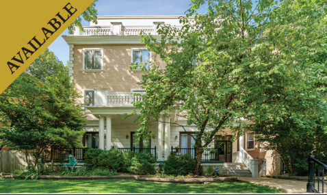
4411 McPherson Avenue, #3 List Price: $665,500