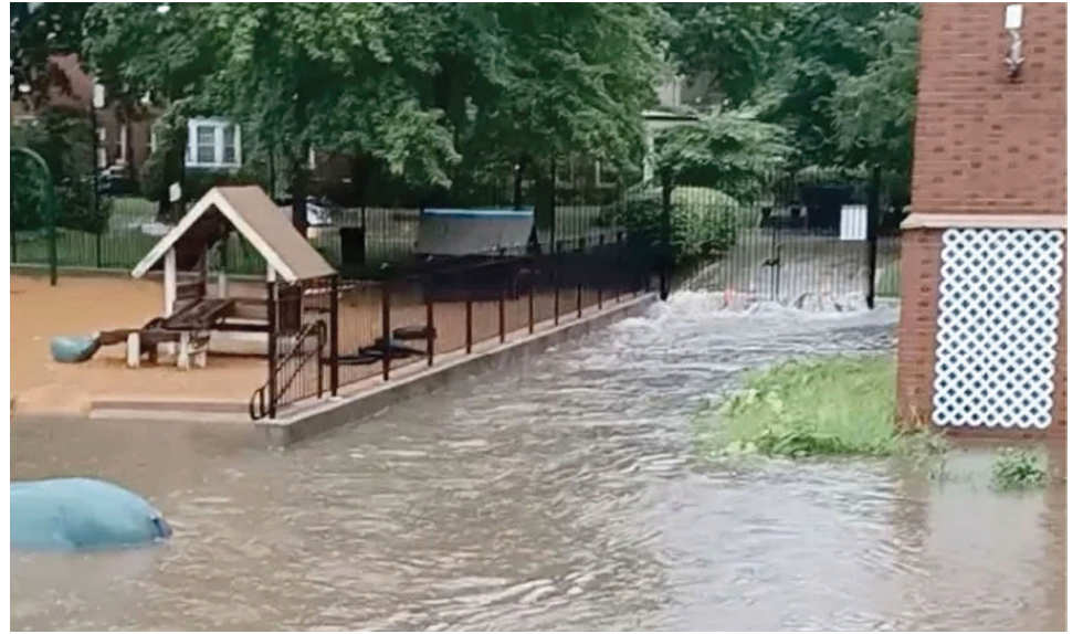
New City School's playgrounds and lower level were quickly flooded from heavy, pouring rain on July 29.