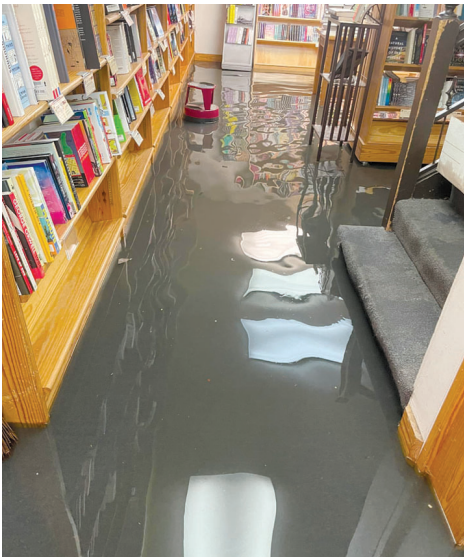
Shelving, equipment, displays and inventory were lost at Left Bank Books due to water from backed-up storm sewers.

Interstates, homes, businesses, schools, public transit and more