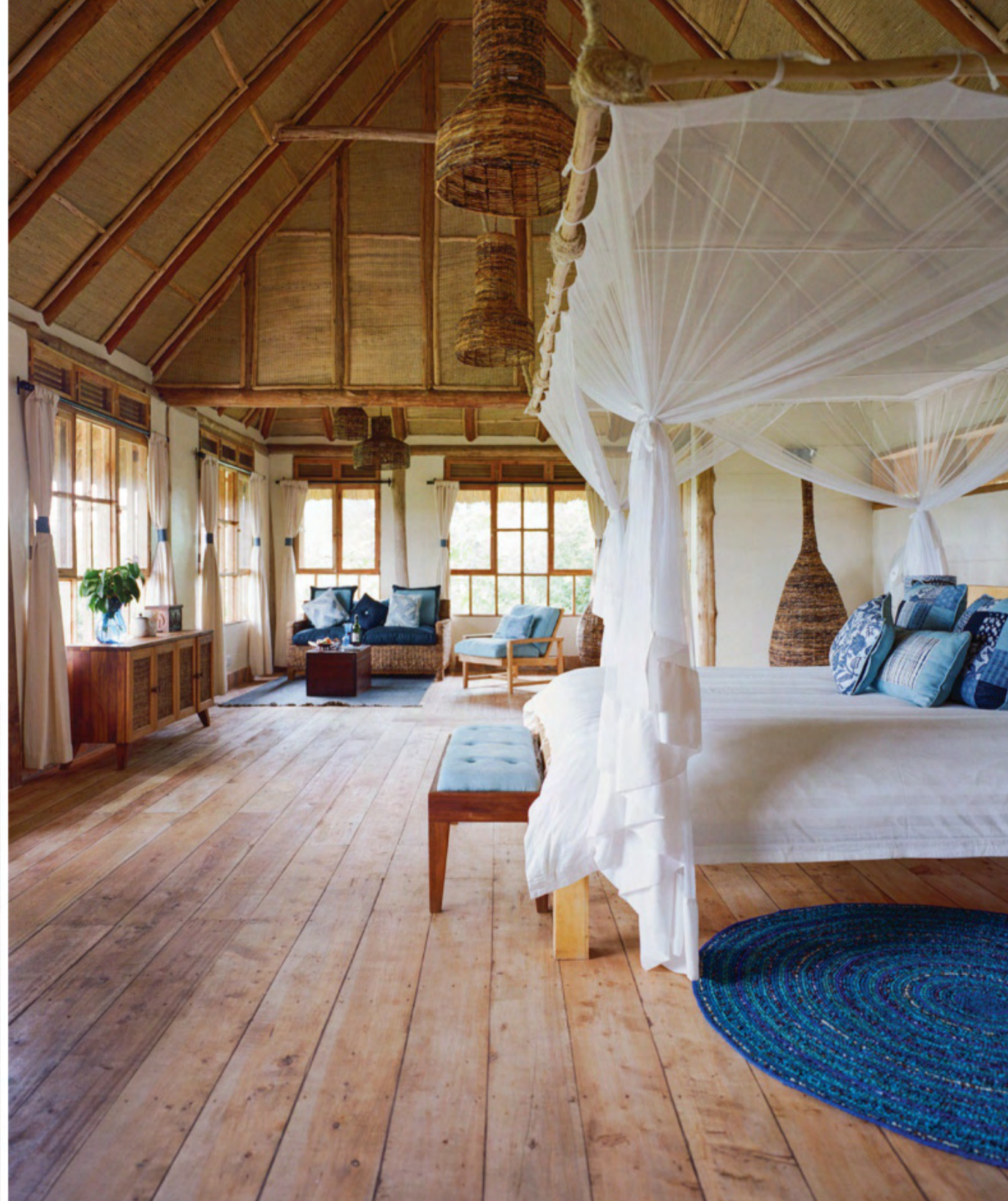
◀ Kyambura Gorge Lodge's four new thatched-roof bandas overlook the eponymous canyon.