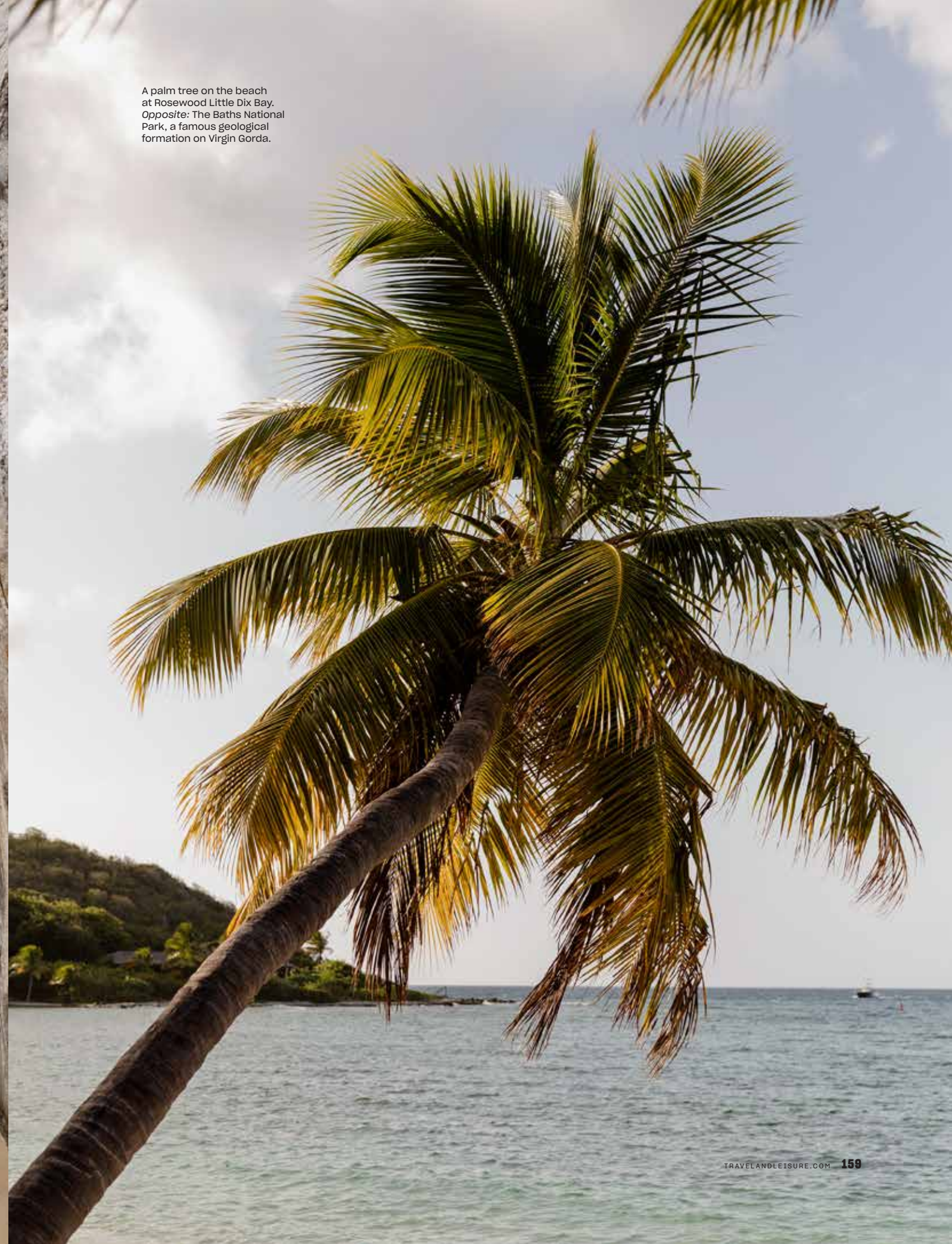
A palm tree on the beach at Rosewood Little Dix Bay. Opposite: The Baths National Park, a famous geological formation on Virgin Gorda.

I swam and sunbathed for hours, living out a castaway fantasy that included the unlikely additions of a gourmet picnic and a chilled bottle of Moët.