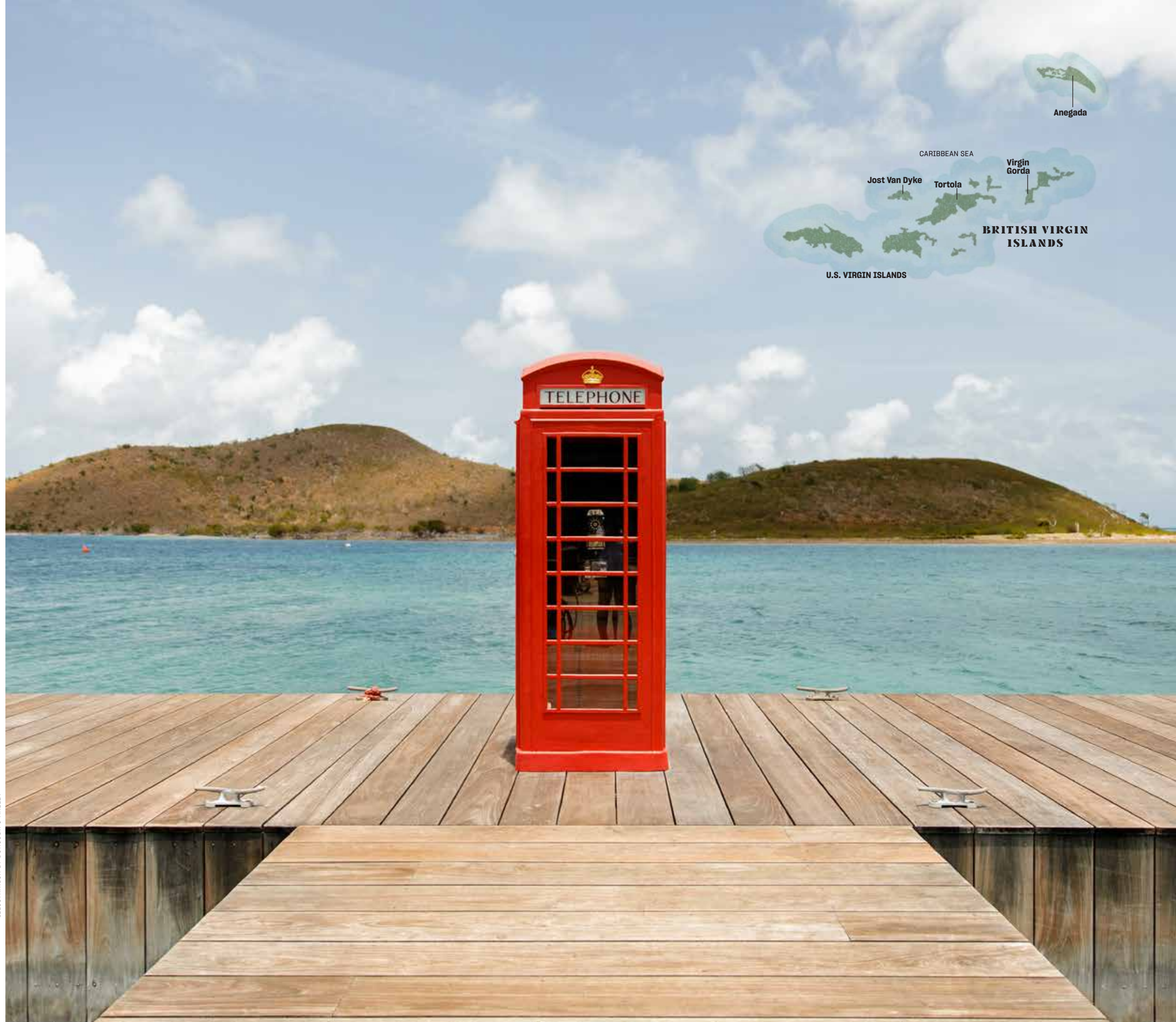
ILLUSTRATION BY DONOUGH O'MALLEY