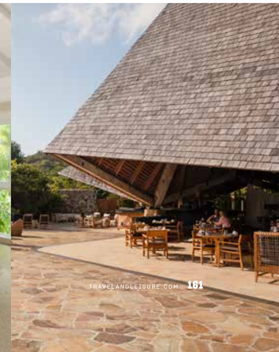
Rosewood Little Dix Bay, as seen from the water. Opposite, from left: The Rum Room bar; a Tree House suite; the Pavilion, an alfresco dining area.