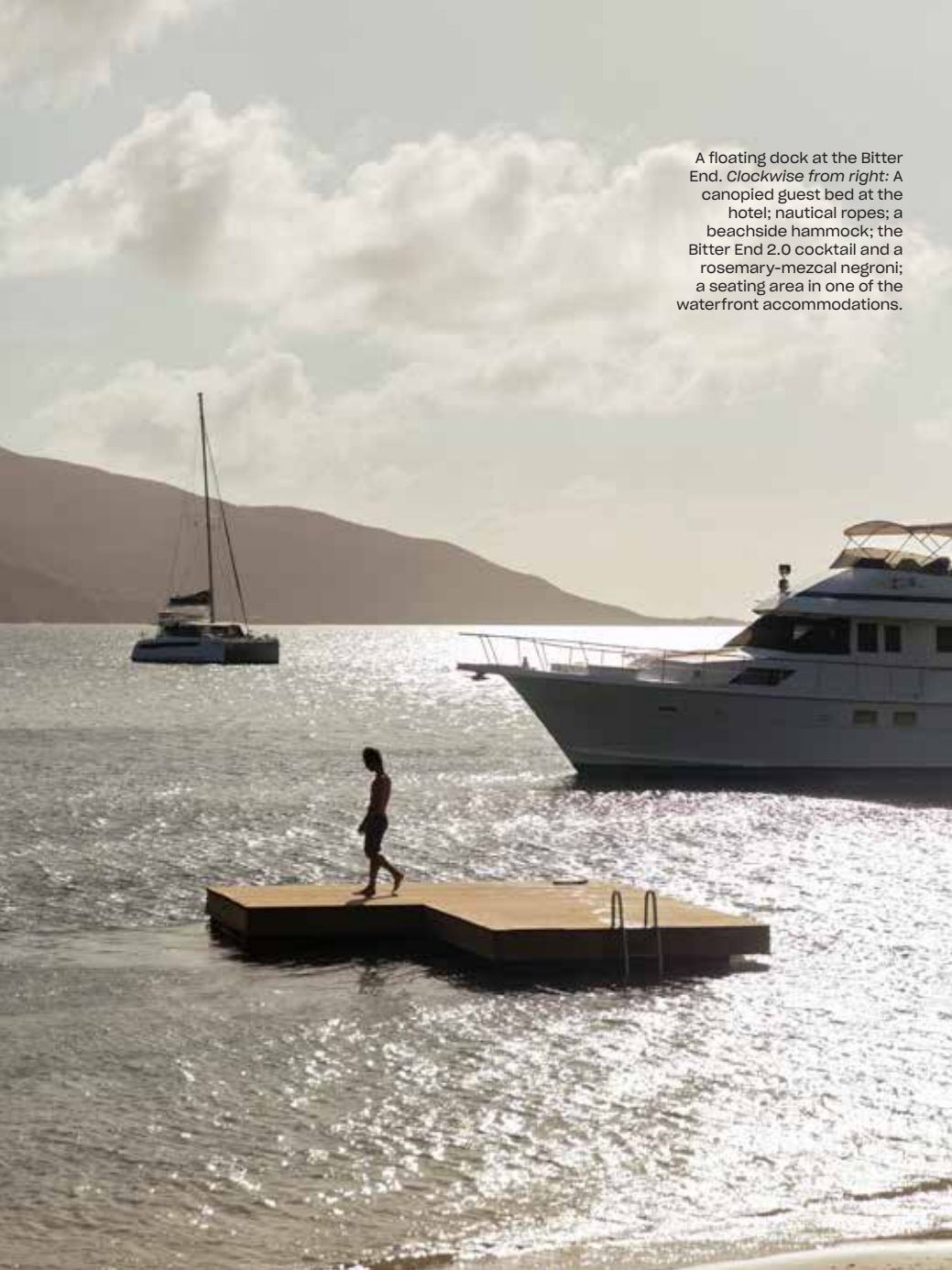
A floating dock at the Bitter End. Clockwise from right: A canopied guest bed at the hotel; nautical ropes; a beachside hammock; the Bitter End 2.0 cocktail and a rosemary-mezcal negroni; a seating area in one of the waterfront accommodations.