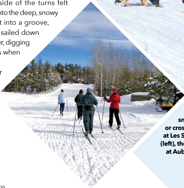
After snowshoeing or cross-country skiing at Les Sources Joyeuses (left), thermal pools await at Auberge La Grande Maison.