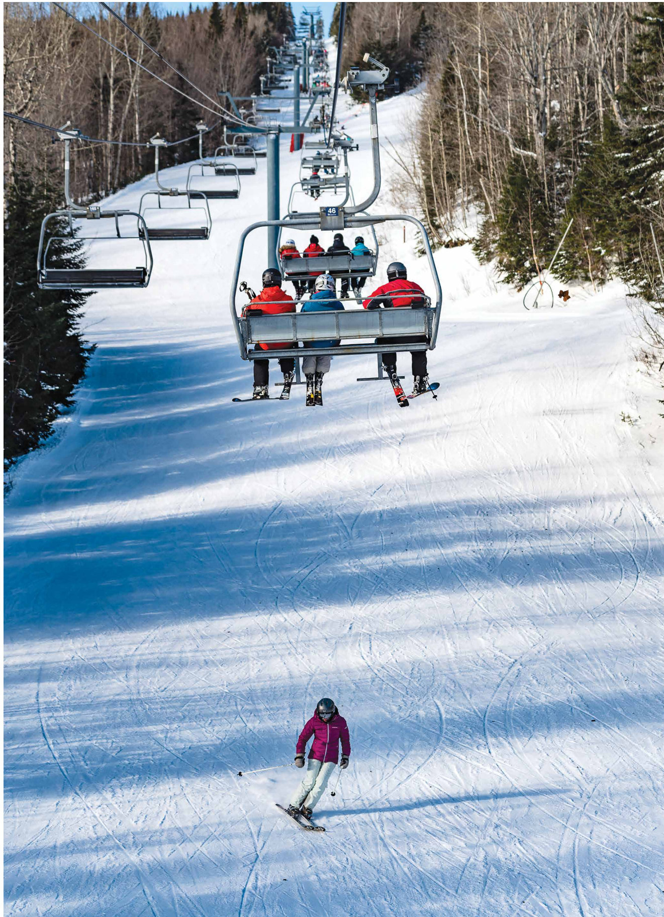
LE MASSIF DE CHARLEVOIX