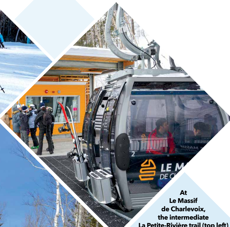
At Le Massif de Charlevoix, the intermediate La Petite-Rivière trail (top left) offers a fine view of the St. Lawrence River. Sledgers on the 4.7-mile piste de luge (center) can reach speeds of 30 mph.