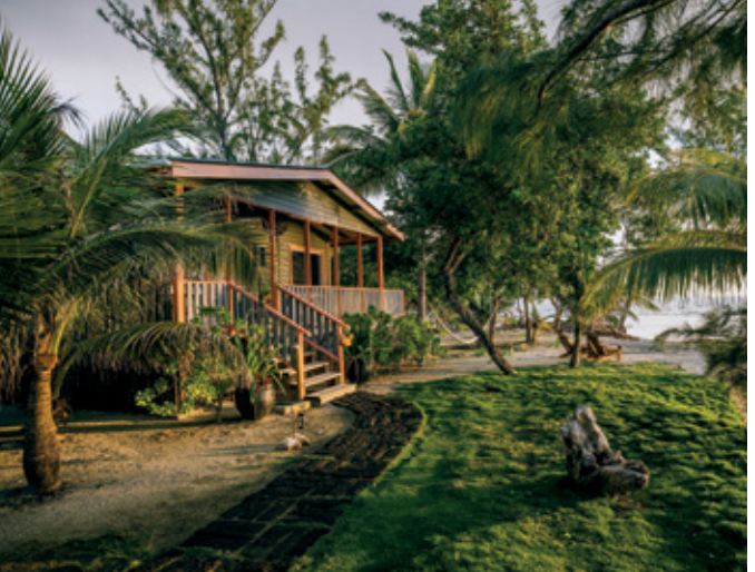
The Family Coppola Hideaways' Coral Caye in Belize.