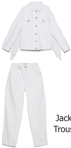
ZARA Jackets: £49.99 Trousers: £29.99