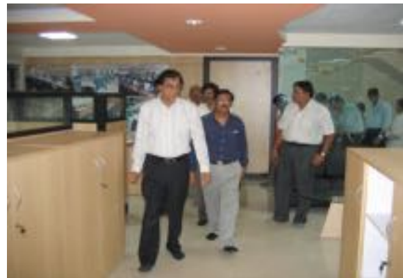
The new EPL Office

PSL – CCS, Daman: Trials are being conducted in the modified old Holiday Detector in online coating of rebars conveyor (750 mm), with six stations.