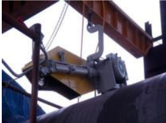
Weld seam removing machine

PSL Jaipur acquired 35 acres of land, 50 km from Jaipur airport on state highway no. 2 and has established two spiral pipe manufacturing units and one 3-layer poly olifine coating plant.