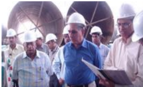
Project Director, Chief Engineer & L&T Rep., RUID Project

Operation has been successfully started from 3 rd week of April 2007. The quality and production capacity of pipe manufacturing and coating was appreciated by the Project Director and Chief Engineer of Rajasthan Urban Infrastructure Development Project who has given us the order of 80,000 metric ton of coated pipes of 94” and 98” diameter of 12-14 mm wall thickness.