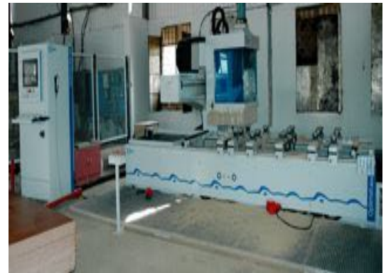
CNC Router – EPL, Daman