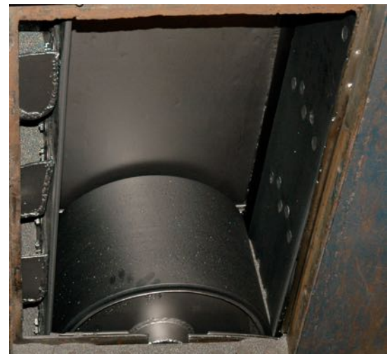
Rubber belt installed