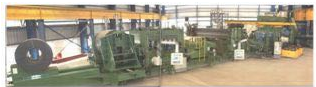
Helical Two Step Technology Pipe Mill – Varsana - 2