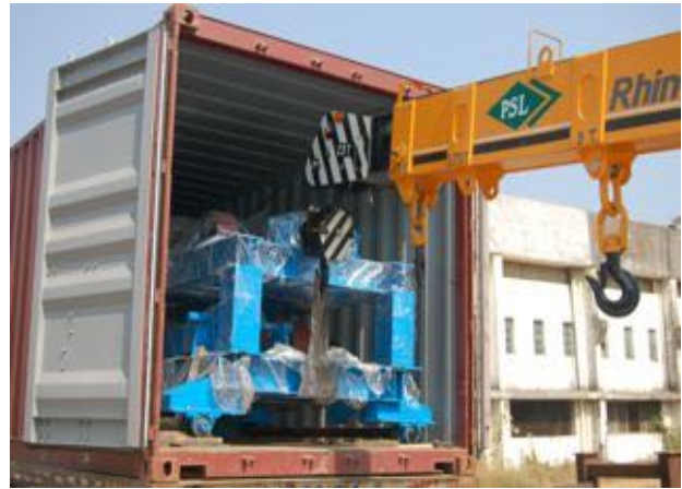
A container in Daman being loaded for PSL FZE (Sharjah)

“Green the earth and the world will grin 😊”