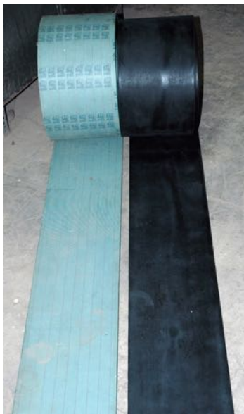
Canvas v/s Rubber