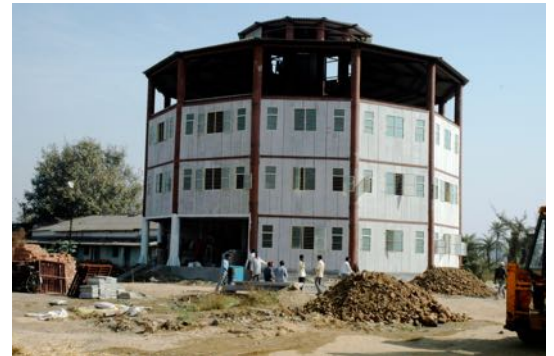
Belgium Tower, Kachigam – Daman

This G + 3 building made of steel pipes and prefabricated cement slabs, houses 45 Nos. 1-BKT units.