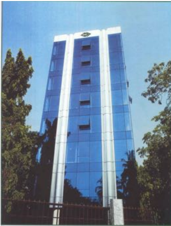
PSL Corporate Office, Mumbai

I like new beginnings because they are filled with infinite possibilities like the challenge of a new year, the start of a project, new To-Do lists and yes, launch of a newsletter like the one you are holding in your hands.