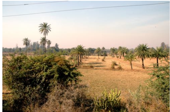
Trust Land Kalgam ( Gujarat )

However, to begin work on the other 8 phases of the project, a 14-acre plot of land in Kalgam ( Gujarat ) has been finalized for purchase.