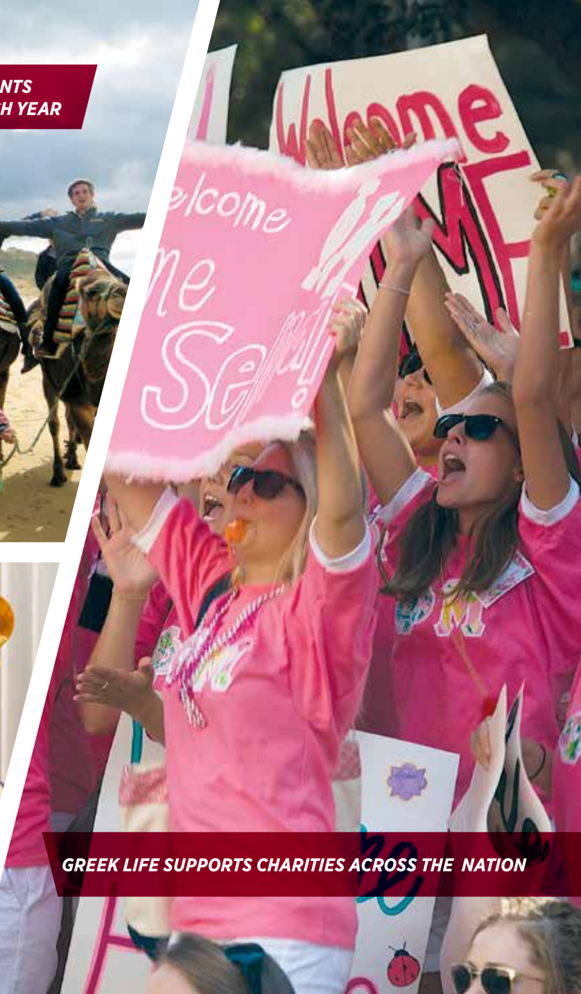
GREEK LIFE SUPPORTS CHARITIES ACROSS THE NATION