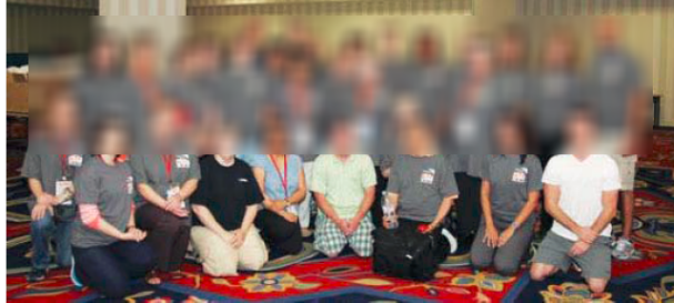
Helping Hands Team

"Building the caregiver packages collectively as a Medical organization was a very rewarding activity and served as a reminder of why we come to work every day... to make a difference in the lives of patients"