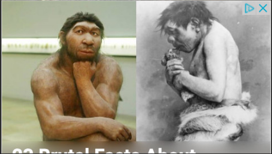
99 Brutal Facts About