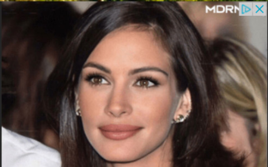
Julia Roberts' Daughter