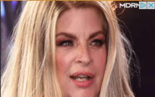
Kirstie Alley, 71, Is