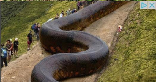
[Pics] The Largest, Most Massive Animals On The Planet