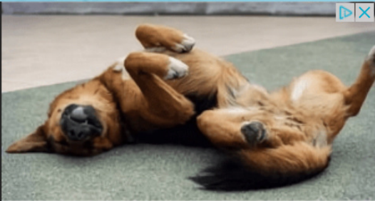
This Dog Behavior Isn't "Normal"