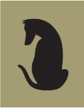
‘Look Out,’ 2013