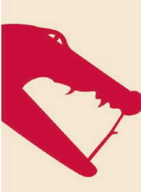
Cover for Diplomat magazine, ‘Deference’ issue, 2012