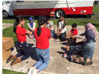
Red Cross Club volunteers teach Citizen CPR at SF Fleet Week on October 9.

There have been a lot of opportunities for Red Cross Club members to participate in October. More than 50 youth volunteers attended the annual San Francisco Fleet Week , teaching citizen CPR and home fire safety.