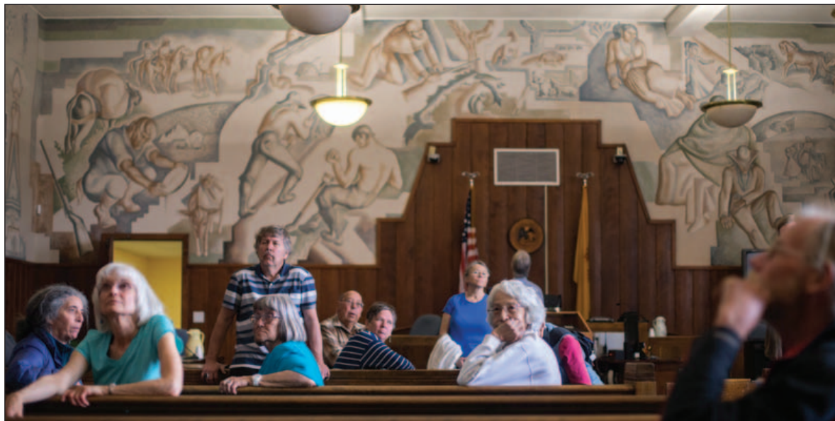
In this 2018 photo, visitors on a tour of Gallup's New Deal art, take in the breathtaking 2,000-square foot mural-in-the-round by Lloyd Moylan depicting Southwestern history from prehistoric times to the turn of the century, painted circa 1941, in the courtroom of the WPA McKinley County Courthouse.

artists better, visitors can "meet" all of the named artists in the