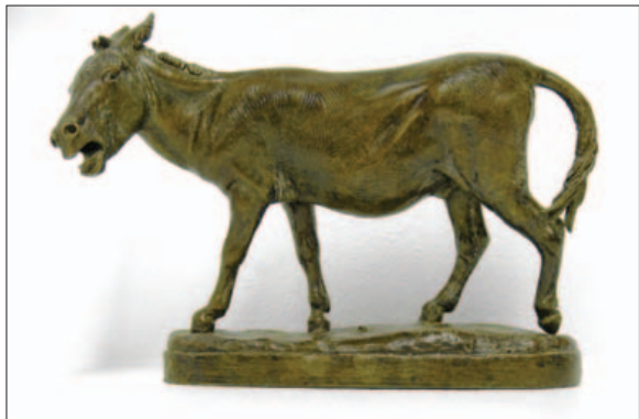
Bronze sculpture donated by artist Anna Hyatt Huntington to the New Deal Gallup Art Center in 1941, currently on view at the Octavia Fellin Public Library.

To learn about the Gallup New Deal Art Virtual Museum, visit: https://galluparts.org/newdeal/