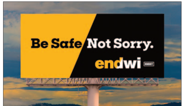
ENDWI campaign billboard designed by RK Venture for the ENDWI Fall/Winter campaign against Driving While Intoxicated.

There are currently seven radio stations running commer-