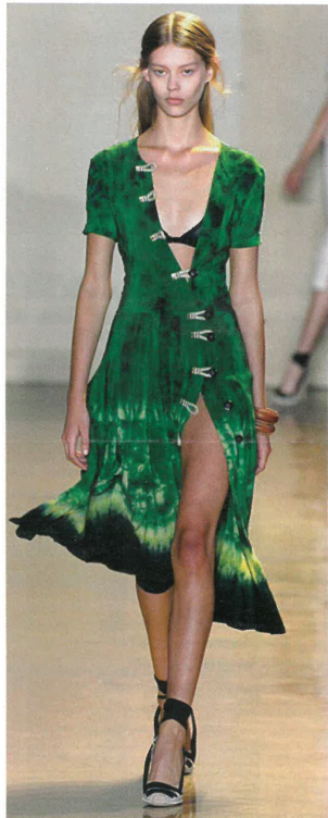
FROM LEFT: Tie-dye from Altuzarra; a vintage vibe from Dolce & Gabbana; romance rules at Erdem; lingerie looks from Alexander Wang.

5. Shiny Showstoppers. Sequins and shiny fabrics will be everywhere this spring. Designers like Marc Jacobs and Alber Elbaz for Lanvin adorned sophisticated Roaring Twenties-inspired frocks with sequins, while others used