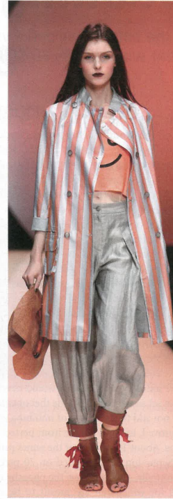
FROM LEFT: Bared shoulders from Prabal Gurung; sassy stripes from Emporio Armani.