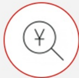
THEFT OF FUNDS

The Cyber Insurance Solution has a component-oriented structure and is made up of the following coverage pieces.