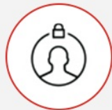
PRIVACY & DATA BREACH LIABILITY