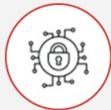
NETWORK SECURITY LIABILITY